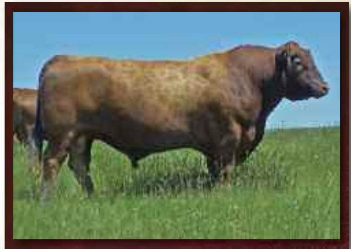
TNTS Bank Statement T272...Ref. Sire Q

What can you say about one of the best, if not the best, young herd bull prospects we have ever had in the 60+ years of the purebred cattle business. He is not only handsome, correct, and muscular, but has one of the best birth to yearling spreads going from a 74 birth ratio to a 116 weaning ratio. We think you will find this phenomenal young purebred herdsire prospect one of the best you will find. Out of a dam with a flawless record, he could be a top sire.