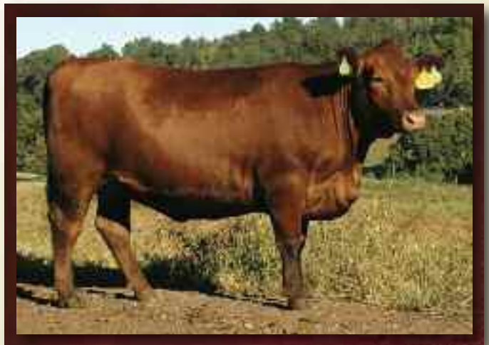
MontVue M045 Split Rock W430...Lot 46

One of my favorite spring bred heifers by the Nebula M045 bull out of the 108.4 MPPA Lot 43 cow; as deep and thick as you can make one. This should make a terrific cow with her outstanding maternal and carcass EPDs. Only in complete dispersions does one have a chance to purchase females like this. AI Ref. Sire Q: TNTS Bank Statement T272 5/18/10, PE Ref. Sire P: MontVue Red Future W439 5/25/10 to 7/31/10