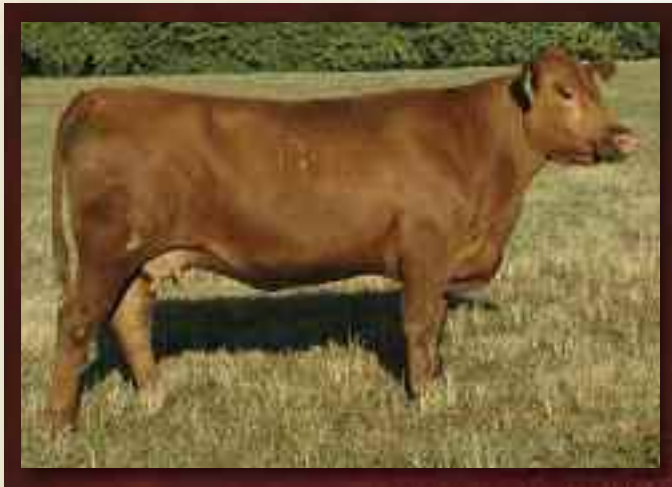
LCOC Eclipse RA150...Lot 120

This excellent Jewel Maker daughter out of Lot 109 lost her spring calf due to pneumonia. Her full brother is in the Beef Maker Bull Sale, W487, a top prospect and was strongly considered for a MontVue herdsire. She did a great job fostering X606, a bull calf by Feddes Direct Norse 7130, out of one of my favorite cows that we lost due to "milk fever". She was by LCC Major League A502B out of a direct daughter of RD Bonnell 19E, foundation of the Copeley Herd, VA. PE Ref. Sire C: Feddes Direct Nors 7130 5/25/10 TO 7/2/10, PE Ref. Sire I: RHRA Advance 274 86R 7/2/10 TO 7/31/10.