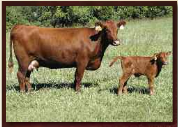
MontVue 102 Lakota T209...Lot 68

The Mooreland Waco cow family is a well known "old line" of cows. She has a good heifer calf at side, #1373960, by Ref. Sire A: LCB Jewel Maker N155, tattoo X653, born 8/23/10.