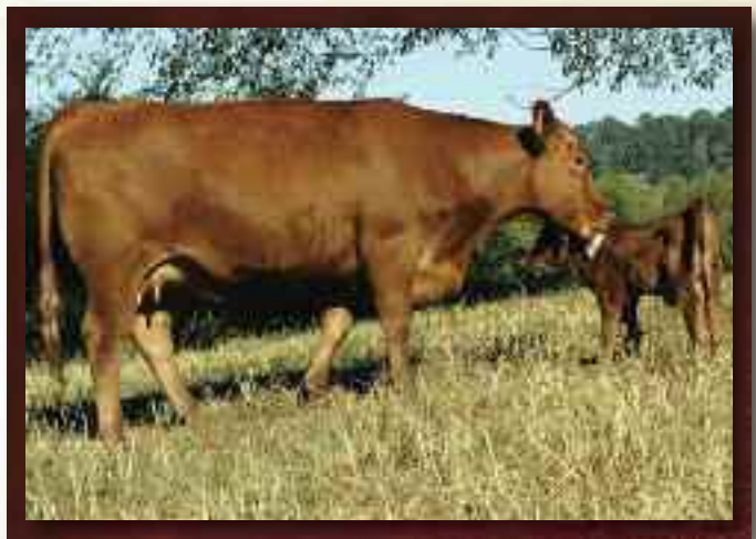
MontVue 10K Cricket U323...Lot 5

Kindle 10K, besides being one of the highest marbling EPDs in the RA breed, sires excellent females with wonderful dispositions and beautiful udders, and this is one of them. She is out of the Hammel C-Canyon LA856 cow, the best of the Cherokee Canyon group. Lots 5 and 6 were high on our "keep list" and you will understand why when you study them. Sells with bull calf, #1373965, by Ref. Sire M: MontVue S008 Packer U354, tattoo X663, born 8/30/10.