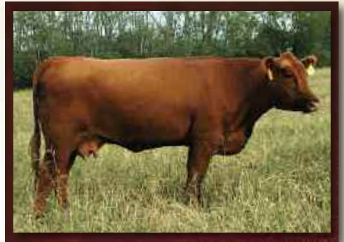
MontVue 7249 Ilka U344...Lot 19

Sells with bull calf, #1373981, tattoo X682, born 9/8/2010, sired by Ref. Sire M: MontVue S008 Packer U354.