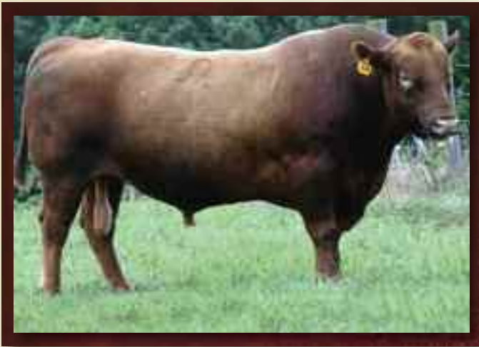
LCB Jewel Maker N155...Ref. Sire A