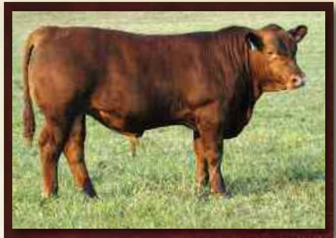
MontVue S008 Packer X580...Lot 44

Unbelievable young son of Packer. As thick made young bull calf as we have seen. He was our heaviest weaner (ratio 118!), structurally correct, moderate framed, and absolutely loaded with meat and muscle. I just hope that a young herd bull prospect like this one gets a chance with a good set of RA females. He is special. Top 3% YW, top 40% MAR, top 6% REA EPDs. I just wish he would remain in a contemporary group to get more proof on his EPDs.