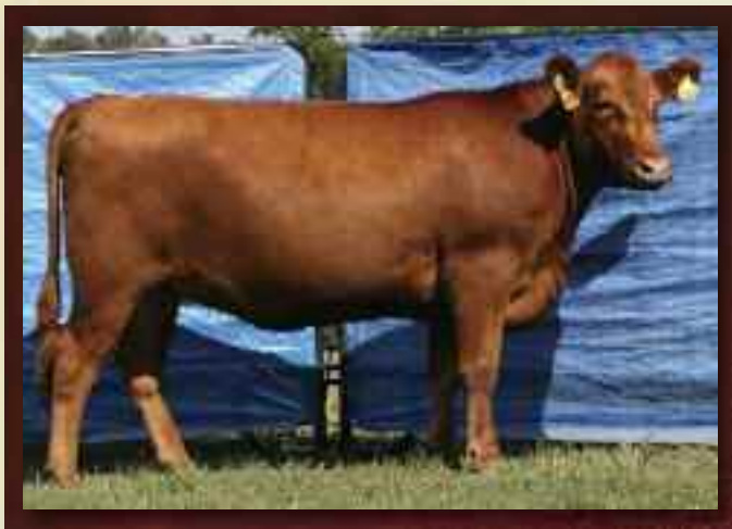
MontVue 10K Maita U398...Lot 139