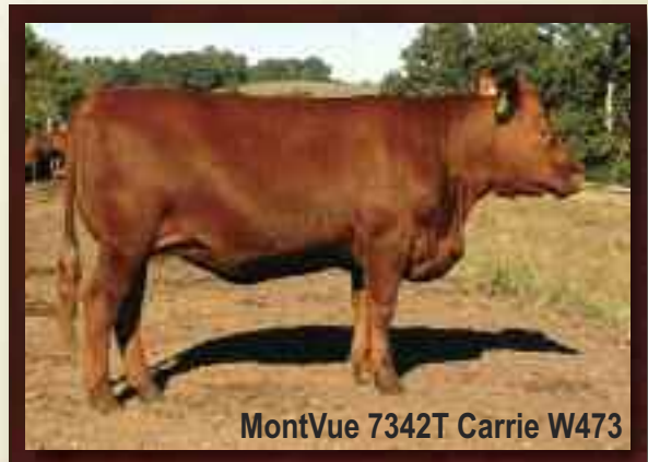
MontVue 7342T Carrie W473

I think this is one of the best Schuler Envy 7342T heifers in the sale. Shown by Montgomery Dempsey in the junior shows. Outstanding EPDs and performance with top 1% REA. AI Ref. Sire R: Messmer Packer S008 5/12/10, PE Ref. Sire P: MontVue Red Future W439 5/24/10 to 7/31/10