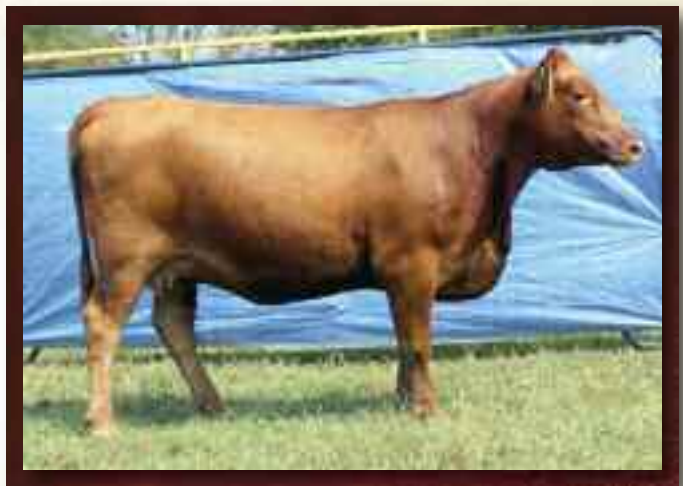
MontVue 10K Rose U388...Lot 62

Good example of the udder and foot structure that Kindle 10K sires. Her mother, going back to the Red Spread 1271F donor cow, FHCC Rachille 920, is owned by Lackey Farms, MO. She has a bull calf at side, #1373982, by Ref. Sire H: Schuler Envy 7342T, tattoo X642, born 8/16/10.