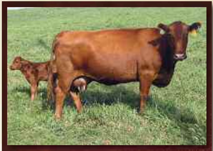
Hammell C-Canyon LA856...Lot 4