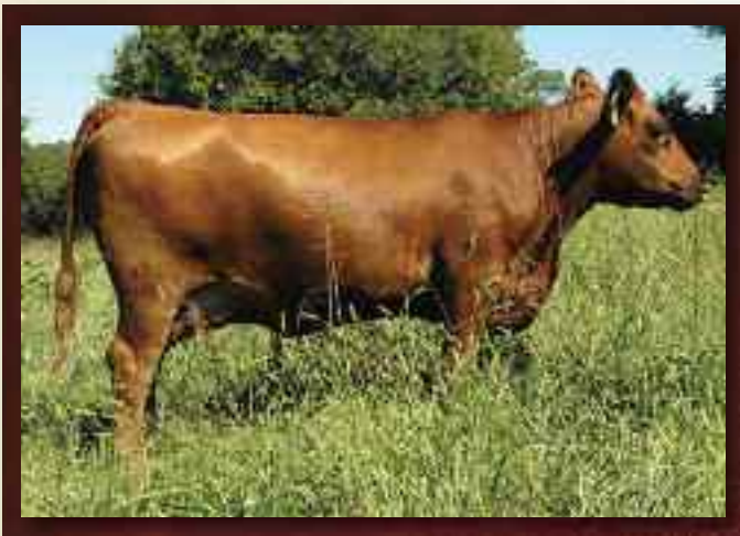
TDF Lakina T144...Lot 67

Her 103.7 MPPA OSF Grand Canyon 1244G dam, Lot 92, is one of our best. The performance and EPDs of this Jewel Maker N155 daughter are tops. Even better, she has a heifer calf at side, #1373974, by Ref. Sire H: Schuler EnvY 7342T, tattoo X654, born 8/22/10.