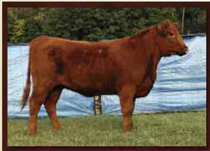
MontVue 7249 Lakota W492...Lot 154

Many of this group of open fall calving heifers was slated for our "keeper" replacement group. We think this set of heifers will work with any number of bull choices. These heifers represent a step forward in our breeding program and should become good additions or foundations for progressive programs.