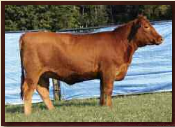
MontVue R007 Belga W543...Lot 168