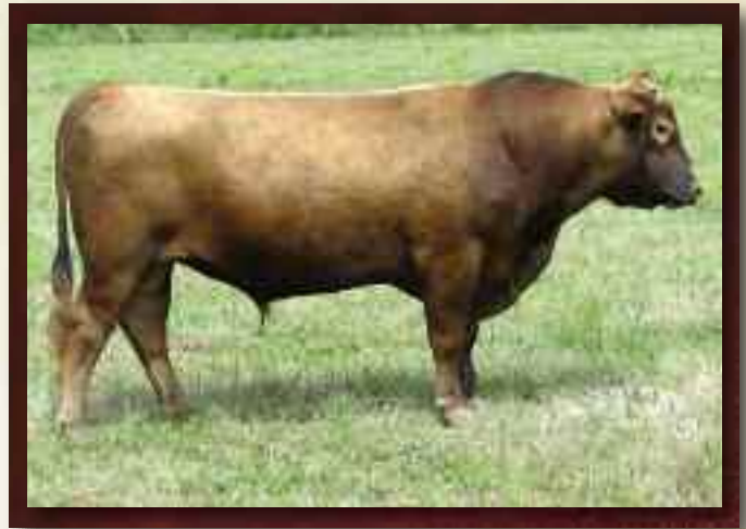
LSF Merger 7013...Ref. Sire F