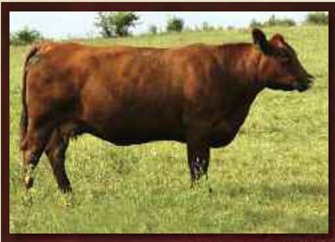
COP Ms 1271F P024...Lot 82