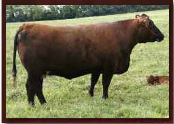
MontVue 649M Belga T091...Lot 36

Sells with a bull calf, #1373961, tattoo X684, born 9/10/10, sired by Ref. Sire K: MontVue N155 Jewel U290.