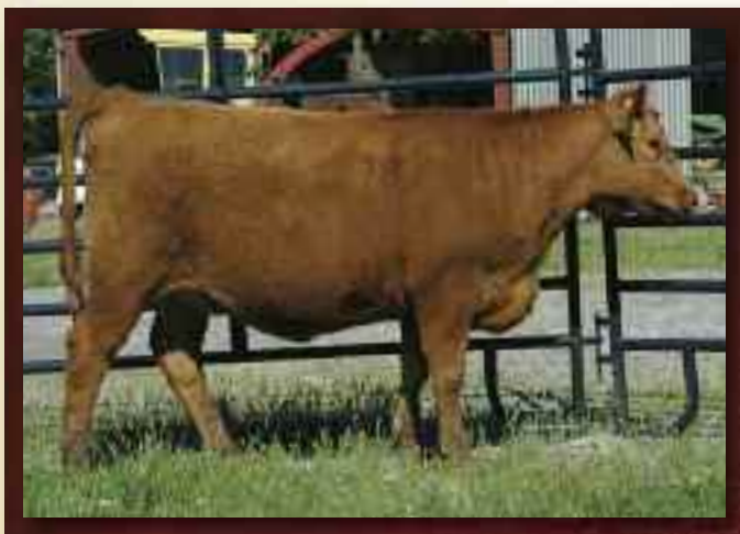
MontVue 7013T Birdie W444...Lot 141

This Merger 7013T daughter from a LCB Goldrobber 1105P dam was a top selling heifer at the 2007 Whitley Red Angus Farm, AL, sale. PE Ref. Sire P: MontVue Red Future W439 5/24/10 TO 7/31/10