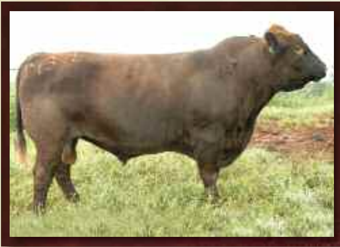
Beckton Lancer M375 TD...Ref. Sire E