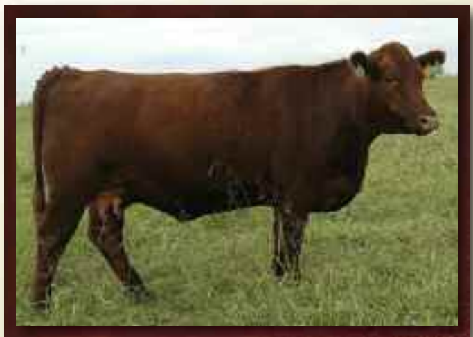
MontVue M045 Omak T139...Lot 72

A lovely, high indexing Nebula M045 daughter from a favorite cow family, the Omak's. We love the Nebula M045 cattle. Check her Bank Statement T272 fall open heifer Lot 159. Sells with bull calf, #1373937, tattoo X673, born 9/2/10, by Ref. Sire K: MontVue N155 Jewel U290.