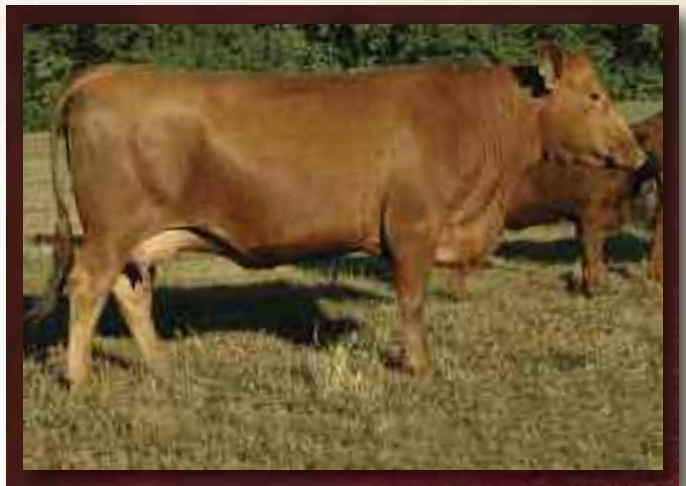
MontVue N155 Split Rock S088...Lot 45

This Jewel Maker daughter of CH Split Rock L9 looks a lot like her mother with an excellent Commitment daughter X631, Lot 45A. Heavy milker and a world of capacity. Lot 71 is a full sister. PE Ref. Sire C: Feddes Direct Nors 7130 5/25/10 TO 7/2/10, PE Ref. Sire I: RHRA Advance 274 86R 7/2/10 TO 7/31/10