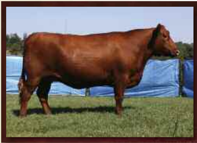
MontVue M08 Make My Day T205...Lot 131

PE Ref. Sire G: KCC Commitment 806U 5/25/10 TO 7/2/10