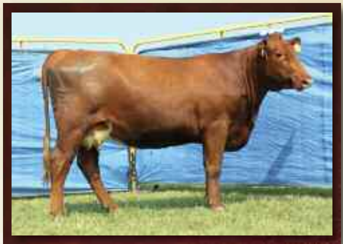
MontVue 10K Belga U377...Lot 61

A ¾ sister to U371, Lot 60, low birth, highly maternal direct daughter of Beckton Rose N286, maternal half sister to the Jones's Red Hill Farm herd sire, Beckton Lancer M361. Sells with heifer calf, #1373971, tattoo X698, born 9/25/10, Ref. Sire M: MontVue S008 Packer U354.