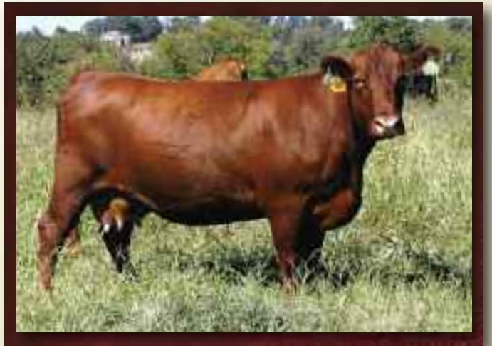
MontVue 649M Belga T097...Lot 37

Sells with bull calf, #1373941, tattoo X680, born 9/5/10, sired by Ref. Sire A: LCB Jewel Maker N155.