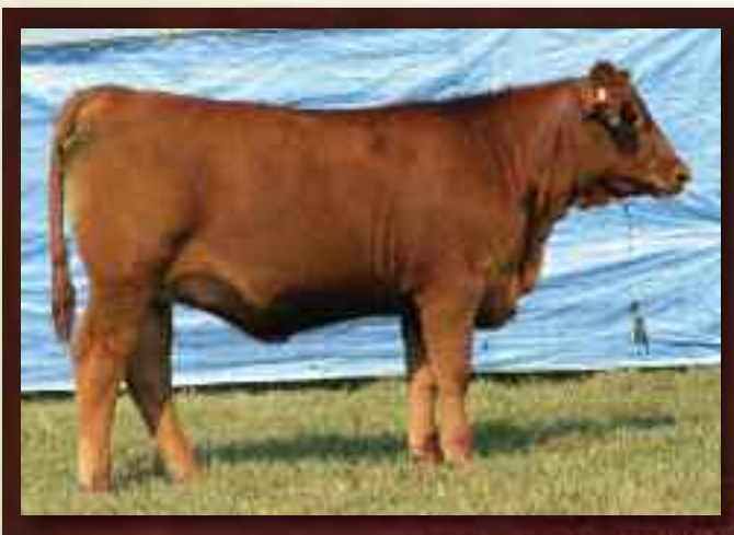
MontVue 7130 Pride X612...Lot 102A

MontVue L313 King Kong R163 was one of the best of sons of the Houston Stock Show Champ, WCC King Kong L313, and the Lakina cow family (see Lots 59, 65, 67, and 92). This young daughter raised a top embryo heifer calf by Messmer Packer S008 and LCC Tilly MB012, Lot 22. PE Ref. Sire F: LSF Merger 7013T 5/24/10 TO 7/31/10