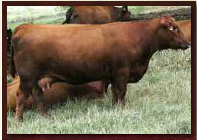
MontVue R007 Red Pride U320...Lot 53

Highly maternal Big Sky R9/Enterprise cross going back to the famous Red Della D109 foundation cow for Ludvigson Red Angus, IA. Sells with bull calf, #1373962, tattoo X657, born 8/25/10, sired by Ref. Sire B: Stalburn Kindle 10K.