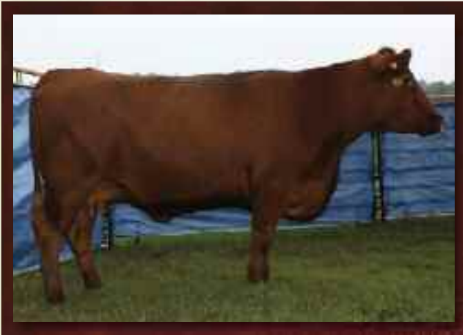
MontVue N155 Ruth U273...Lot 116

Bank Statement is doing a fabulous job all over the country. Here is a young son that is one of the best young herd bull prospects in this, or any other, sale.