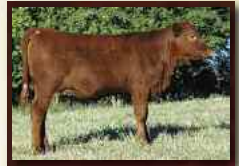
MontVue 806U Chey X616 Lot 8A