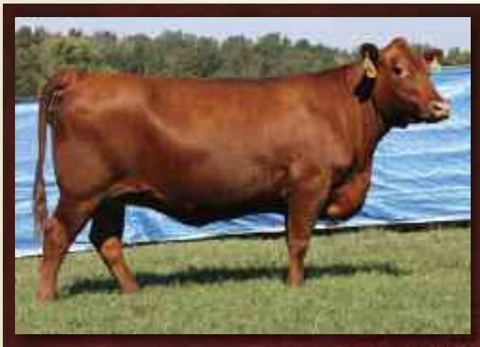
MontVue N155 Carrie T042...Lot 15

Lot 14's heifer calf, MontVue 8700U Carrie X632 (#1364446) born 3/29/10 by Ref. Sire L: MontVue S008 Packer 8700U PE Ref. Sire C: Feddes Direct Nors 7130 5/25/10 to 7/2/10, PE 7/2/10 to 7/31/10 Ref. Sire I: RHRA Advance 274 86R.