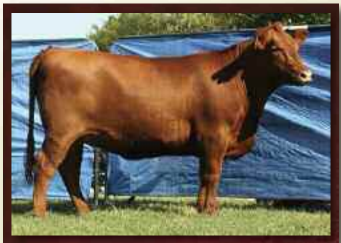
MontVue N155 Tilly U404...Lot 64

Flush mate to Lot 23. We are trying to concentrate the Beckton Julian GG B571 blood in our herd through a flush of LCC Tilly MB012, Lot 20, and LCB Jewel Maker N155. They are super maternal females, top 3% CED and HPG, top 1% CEM. Lost her calf to coyote.