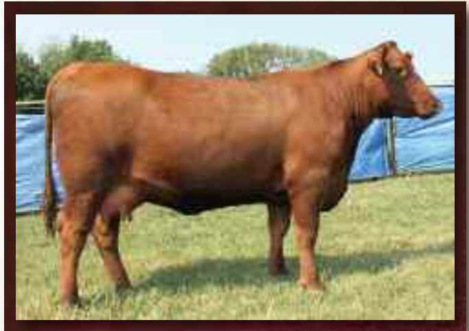
MontVue R007 Red Pride U321...Lot 54

Identical twin Major D R007 heifers out Lot 80. They are truly beautiful animals with great conformation and perfect udders, 7 EPDs in the top 1/3 of the breed. Both of them have Ref. Sire H: Schuler Envy 7342T bull calves born on the same day, 8/16/10. She sells with her calf, #1373967, tattoo X645.