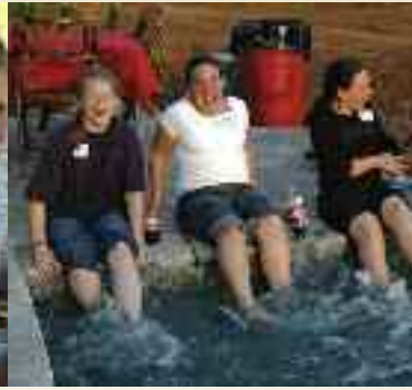
Girls having a great time at field Day MontVue Farm 2005