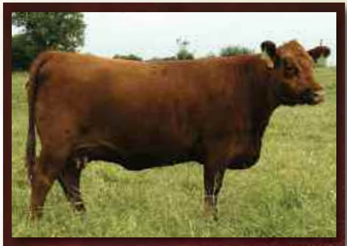
MontVue M375 Princess T160...Lot 70

This is one of my very favorite Beckton Lancer M375 females, deep sided, thick, correct, with a good udder. Her dam is one really good Logan 210 daughter, Lot 94. Sells with heifer calf, #1373959, tattoo X660, born 8/29/10, by Ref. Sire A: LCB Jewel Maker N155 .