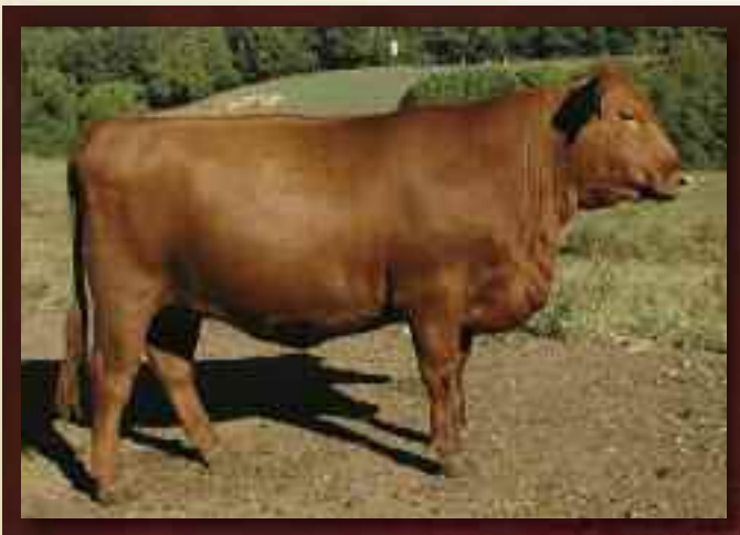
MontVue 7013T Primrose W476... Lot 150

A very special Feddes Direct Nors 7130 out of one of my favorite 103.8 MPPA Buf Crk Dynamics 3820 daughters. Her mother died, and she was raised by a foster parent. You will like this one. She would not be available unless we were dispersing. AI Ref. Sire R: Messmer Packer S008 5/172/10, PE Ref. Sire F: LSF Merger 7013T 5/24/10 TO 7/31/10