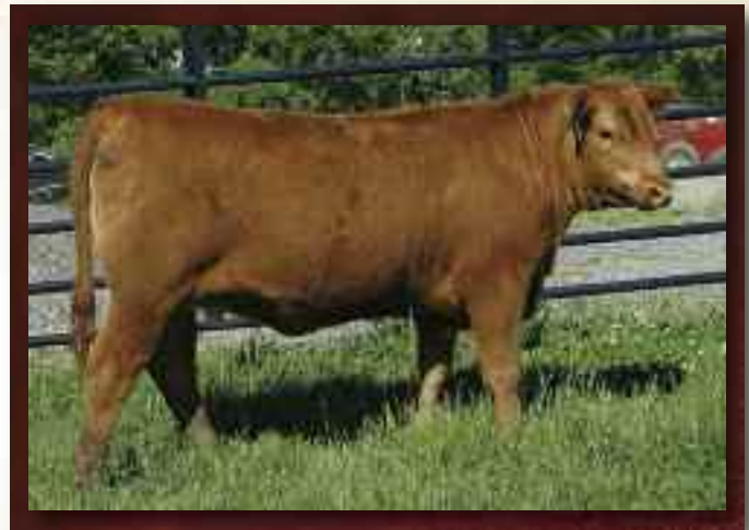
MontVue 7130 Jiba W450...Lot 144