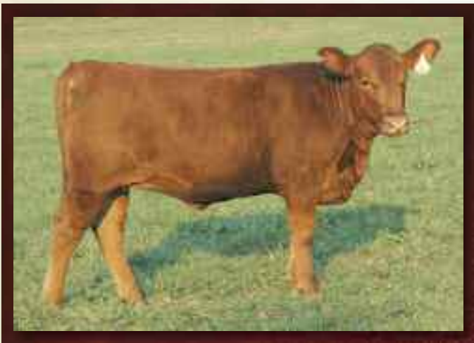
MontVue T272 Belga X573...Lot 2

Reg. #: 1364454 Calved: 02/08/2010 Tattoo: X573 MVK 1A 100.0%