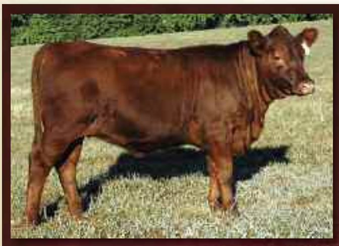
MontVue S008 Tilly X576...Lot 22