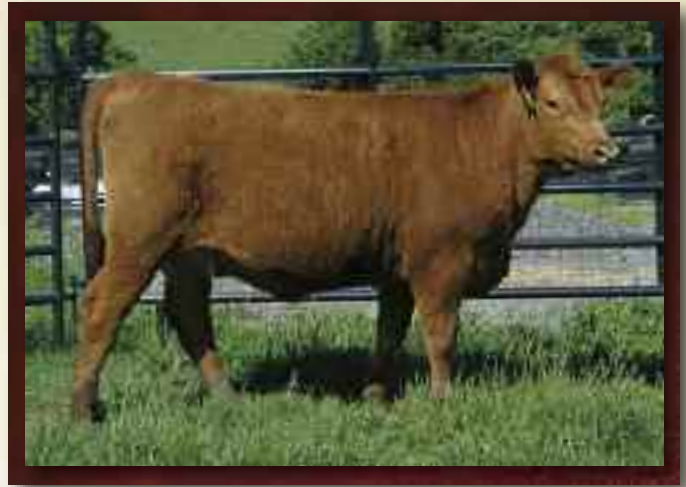
MontVue 7130 Joan W448...Lot 142

Extremely deep bodied, moderate framed daughter of Feddes Direct Nors 7130 and a 102.2 MPPA Lancer F442 dam going back to Dan Stichel's H57 cow. AI Ref. Sire R: Messmer Packer S008 5/22/10, PE Ref. Sire F: LSF Merger 7013T 5/24/10 TO 7/31/10