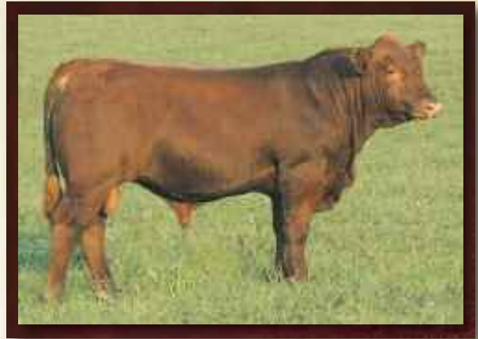
MVK T272 Bank Statement X583...Lot 12

This is one of the best Cherokee Canyon daughters we have ever been privileged to breed. Moderate size, excellent feet and udder and a strong candidate for a flush program. Absolutely one of the most productive females in the herd with two fine daughters, S032 by Lancer M375, and a Jewel Maker daughter T042. We used a Jewel Maker son U290 (see reference Lot K) now owned by Lackey Farms, MO, with an outstanding performance record. Her EPD set, performance, and record are among the best, with a 107 MPPA, 114 MAR ratio, 115 REA ratio. Her TNT Bank Statement T272, Lot 12, is fantastic. He is one of the best herd bull prospects in the sale and will get a lot of attention. Cows like this only come up in dispersions.