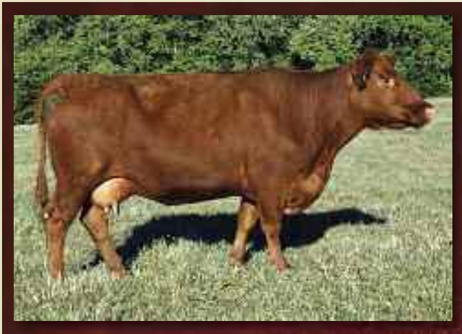
Beckton Belga L237 NP...Lot 1

Reg. #: 762267 Calved: 03/10/2001 Tattoo: L237 BKT 1A 100.0%