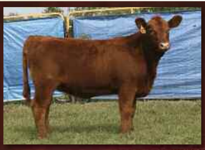
MontVue 7130 Garnet X600...Lot 110A

Buf Crk Medallion N328 is one of the best sires in the Buffalo Creek herd. This outstanding first calf heifer is out of a Beckton Julian B571 daughter of the famous MRM 1431 8611 9109 cow, the dam of BufCrk Cherokee Canyon, arguably one of the most influential sires in the history of the RA breed. Here is a southern adapted, deep sided daughter with a perfect udder and one of the best TNT Bank Statement T272 bull calves in the herd, X578, Lot 113. If this guy doesn't make someone a herdsire we will be surprised and disappointed. PE Ref. Sire I: RHRA Advance 274 86R 5/25/10 TO 7/31/10