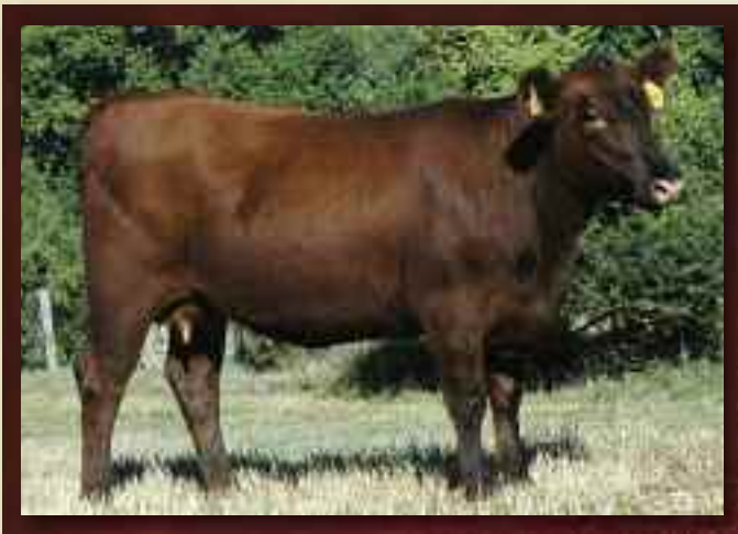
MontVue N155 Lakina U419...Lot 65