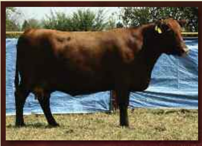
JRN Bonnebell 921J...Lot 47