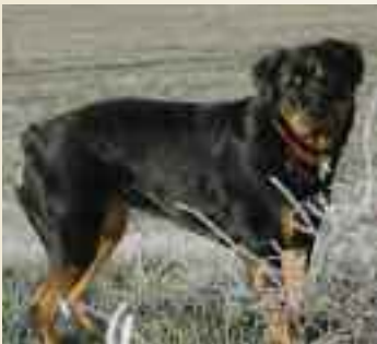
Bucky, top cow dog at MontVue