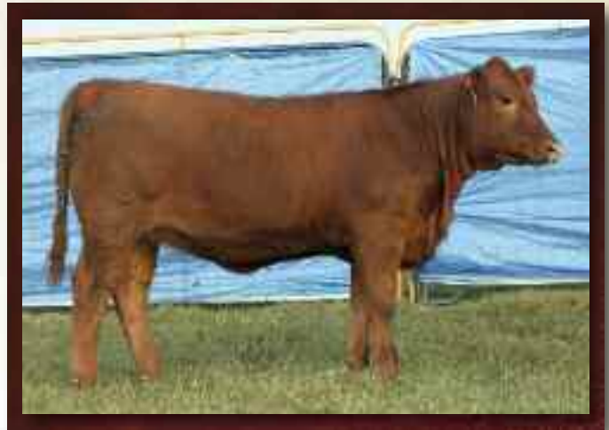
MontVue 806U Amber X613...Lot 106A