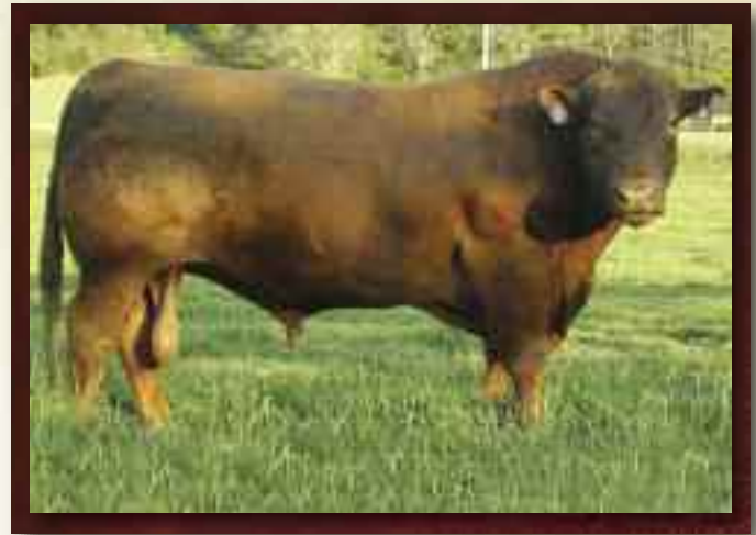
Stalburn Kindle 10K...Ref. Sire B