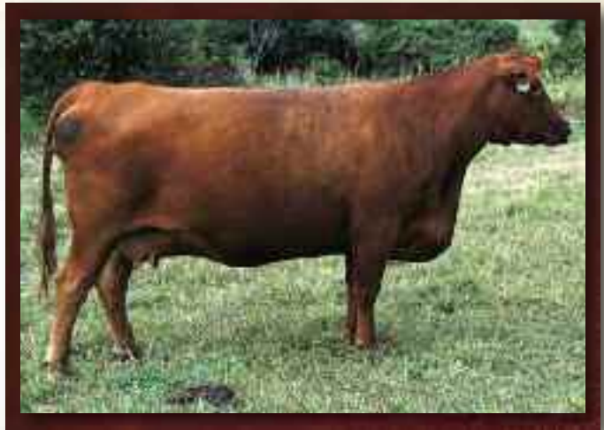
MontVue N155 Red Pride R112...Lot 80