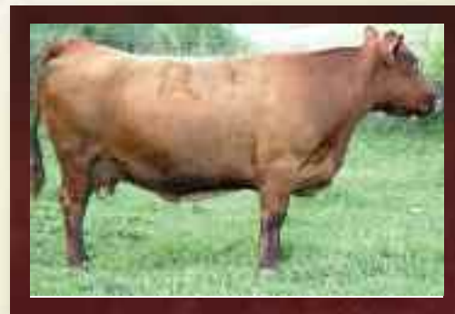
Leachman Dina B2404 Dam of Ref. Sire D