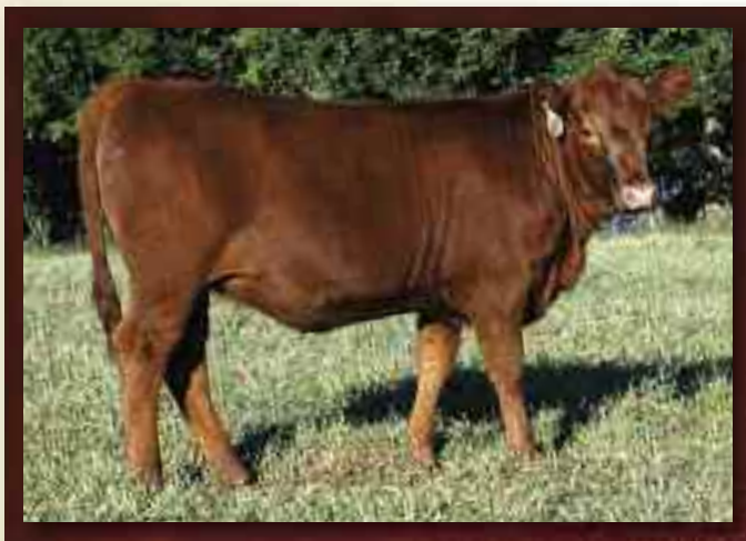
MontVue S008 Tilly X572...Lot 21