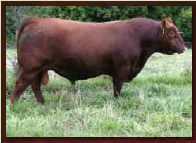
Feddes Direct Nors 7130...Ref. Sire C