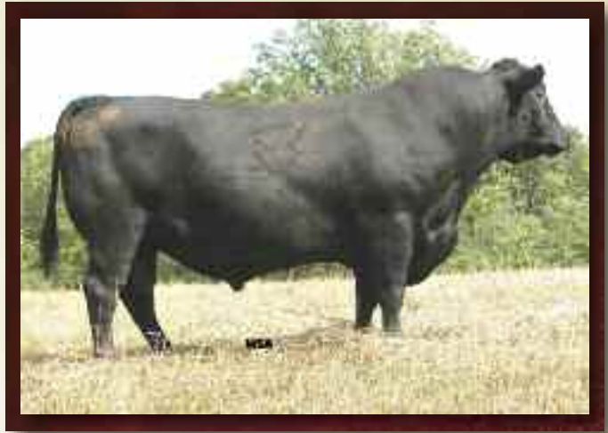
Basin Hobo 649M...Sire of Lots 36-38

Beckton Belga B061 has been our best ET donor. This is a very good footed and uddered Cherokee Canyon daughter. Sells with a bull calf, #1373964, tattoo X658, born 8/5/10, sired by Ref. Sire H: Schuler Envy 7342T. Calf has suffered an injury to one eye.