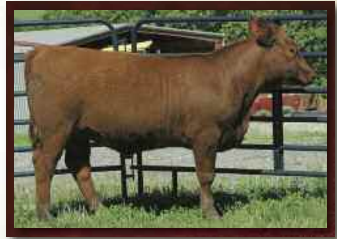
MontVue N155 Red Rose W474...Lot 175

Lots of spread from birth to yearling with performance and carcass from a MPPA 109.8 Marias daughter.