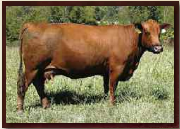
LSF Eleanor MN962 R5029...Lot 77