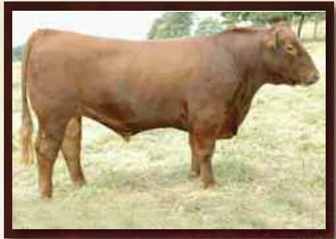
MontVue Major D R007...Ref. Sire D