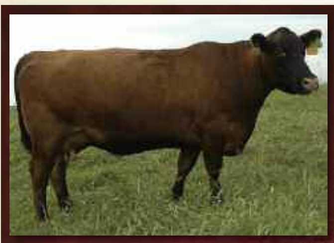
HAD Lokina N316...Lot 84

We have used two sons as herd bulls, MontVue M375 Lancer T155 as well as MontVue S008 Packer U354. Sells with bull calf X699, #1373955, born 9/26/10, by Ref. Sire C: Feddes Direct Nors 7130.