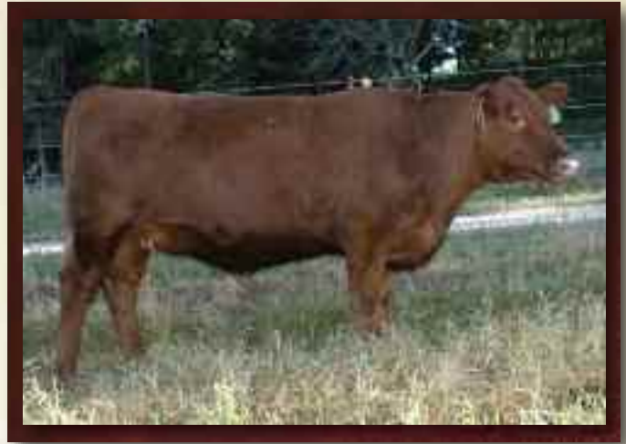
MontVue 7130 Ruth W481...Lot 152

A wonderful Jewel Maker out of our favorite Ho In One 1252J daughter, Lot 123, with outstanding growth (YW 90) and a CED of 5. AI Beckton Nebula M045 (854775) 5/18/10, PE Ref. Sire F: LSF Merger 7013T 5/24/10 TO 7/31/10