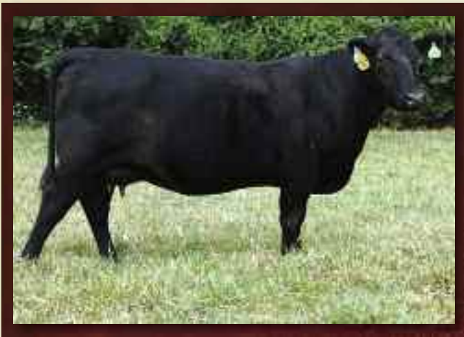
MontVue 649M Belga T101...Lot 38