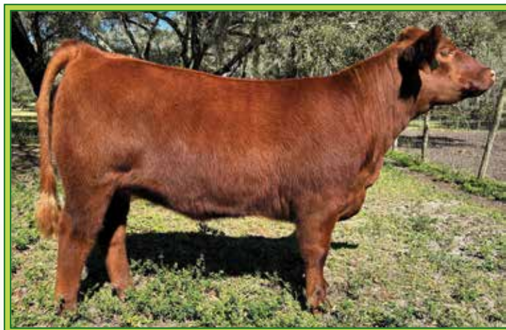
LOT 43 / TAW TOPEKA 2249

Here is an outstanding yearling heifer that we should have kept in Florida but we are determined to share the best of the best with our fellow Southeastern breeders! This young heifer hit the genetic lottery with a dam that won Champion Red Angus at Cattle Bonanza in 2020 and Reserve Champion Division at NAJRAE in 2021! This young heifer is just as bold as her dam with the same spring of rib, big foot, and long feminine neck. Don't forget her sire either, 3 Aces Sideways is known to consistently produce daughters with style and look. Don't miss your chance on this one! You can keep her in the show ring or put her to work! She sells exposed to WATK Hamley 2247.