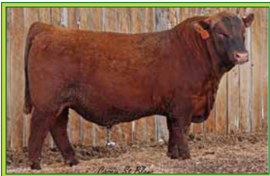
LSF BJR HIGH VOLTAGE 1803J