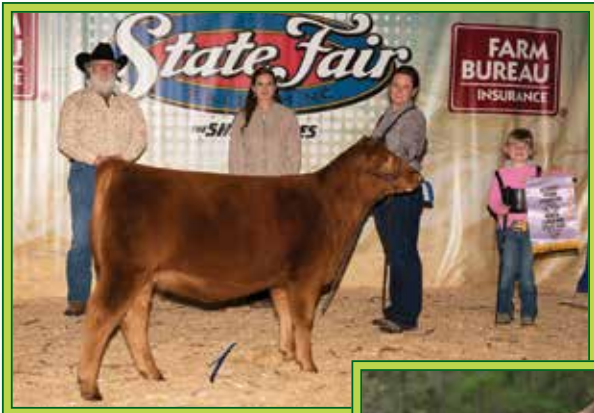
TWIN B JOSOSA

D6400 came to us as a proven donor from the '17 Ludvigson Dispersal, she's a maternal sister to the dam of the $115,000 LSF SRR President 8177F, in turn the resulting calves from these embryos will be ¾ sibs to him. Her 3rd dam is the $50,000 breed legend Larson Flo Marie 185. We have a spring yearling flushmate sister from this flush that's feminine with unmatched body mass and dimension. The impressive projected EPD's for the resulting calves will be in the top 15% of the breed for CED, BW and MB as well as top 20% GM. Guarantee (1) pregnancy if implanted in an AETA tech within (2) years of sale day.