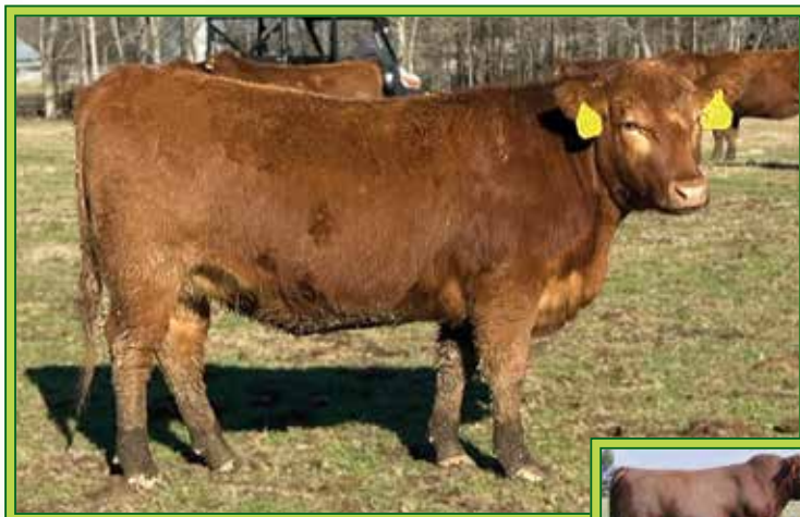
LOT 23 / VETO FLOWER 0G15 933K

A direct daughter of Complete 7000E! Complete has caused a commotion since he sold in '17 for $190,000 and continues today with his elite carcass, high performance progeny. 933K's top 1% MB EPD and her 133 IMF ratio proves just that! Now deceased, Complete's semen and genetics command a premium around the country. The Flower cow family is a prolific and highly proven one with 933's deceased MGD having nearly 60 progeny registered. The Flower's are also the family that produced the popular Brown Vacation. As a 4-year-old, 0G15 has a near perfect udder and feet as well as a 104 MPPA. AI'd 11/24/23 to LSF EXC Call of Duty 9065G (4250593) a top 1% ProS HXC Allegiance X LSF Night Calver low birthweight rising star. Ultrasound confirmed bred 2/19/24 carrying a heifer. Retaining (1) flush/aspiration of at least 6 embryos at buyer's convenience and seller's expense.