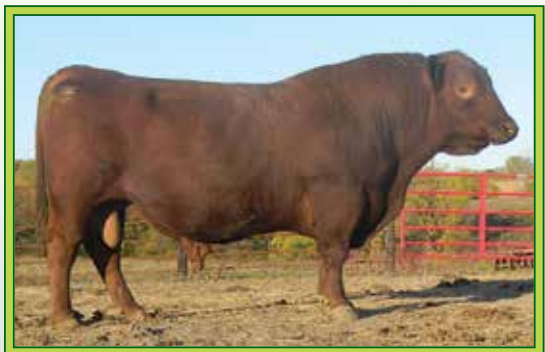
CHAPPELL HOME RUN H418