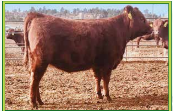
LSF SRR GILDA G9157 J1072

LSF SRR Gilda J1072 [4456519] was Boot Jack's pick of the President daughters at the historical Ludvigson Dispersal where her dam brought $12,500 and her MGdam brought $22,000. J1072 has earned a 111 MPPA and has multi-trait balanced EPDs ranking in the top 1-35% for ProS, HB, GM, BW, WW, YW, ADG, DMI, MILK, ME, HPG, CEM, MARB, CW, REA. J1072 is checking all the boxes of the foundation donor for this cow family at Boot Jack. X LSF SRR Identity 0295H [4276063] is a phenomenal sire that sold to Pieper Red Angus where his first heifer calf sold for $13,000 and first 4 sons averaged $42,000. Unique balanced EPDs ranking in top 1-35% for ProS, HB, GM, CED, BW, WW, YW, ADG, Milk, HPG, CEM, Marb, CW, REA! He is royally bred out of Night Calver and a Bourne x Premier dam of the famous Crystal cow family known for carcass and raising herd bulls! Note Identity is now deceased. Selling 4 Conventional embryos @ Genex Billings with guarantee of 1 90-Day Pregnancy.