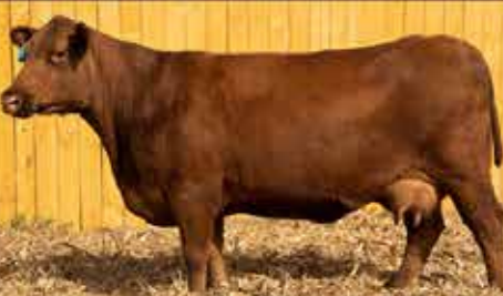
ANDRAS BELLE C081

WE ARE EXCITED ABOUT 106L IN THIS SALE AND OUR BELGA COW FAMILY. DONOR DAM TO 106L IN THIS SALE