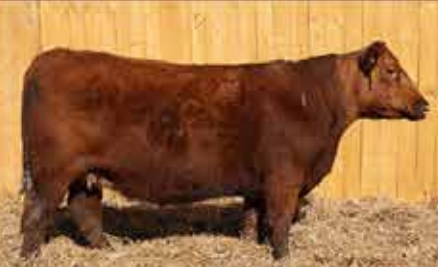
FEDDES LAKINA Y17 023

AN EXCITING DONOR PROSPECT FROM OUR BELGA COW FAMILY. A SOLID FEMALE Sired BY ANDRAS EXECUTIVE ORDER E018. A DIRECT DAUGHTER OF BELGA 1419