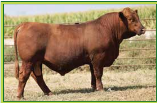
GILCHRIST ROYAL PEACOCK