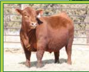
PIE HOLLYWOOD 222