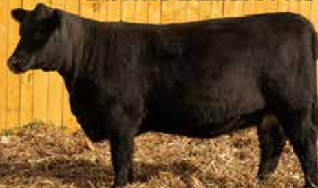
DIX MS BELGA 1419 919J

AN EXCITING DONOR PROSPECT FROM OUR BELGA COW FAMILY. A SOLID FEMALE Sired BY ANDRAS EXECUTIVE ORDER E018. A DIRECT DAUGHTER OF BELGA 1419