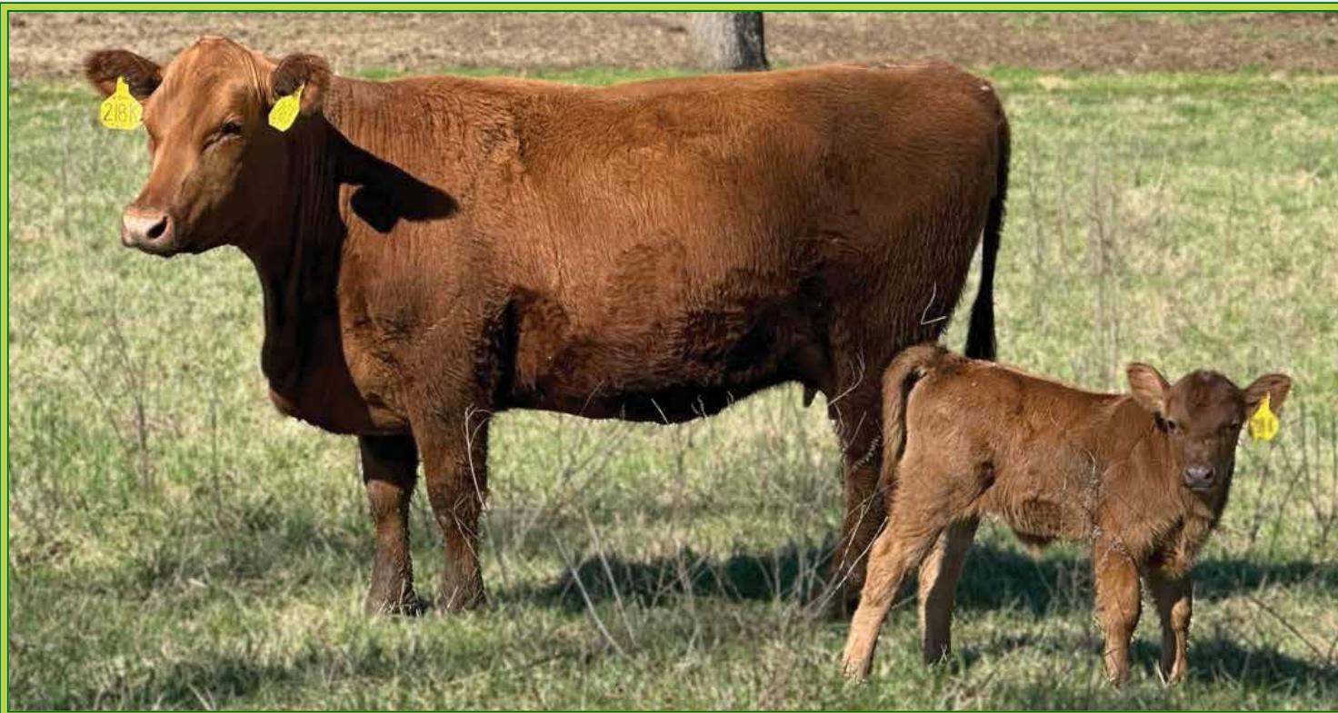
LOT 1 / VETO BERTHA 218K