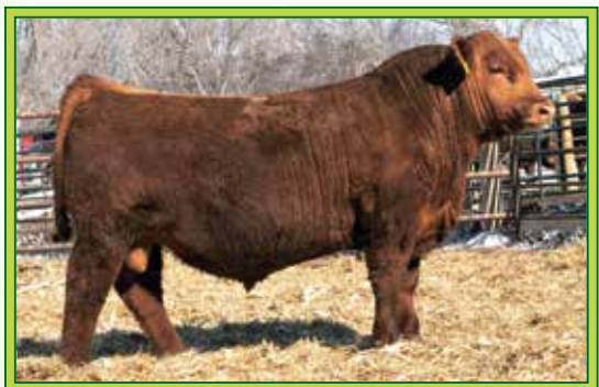
BERWALD COMPLETELY 2056