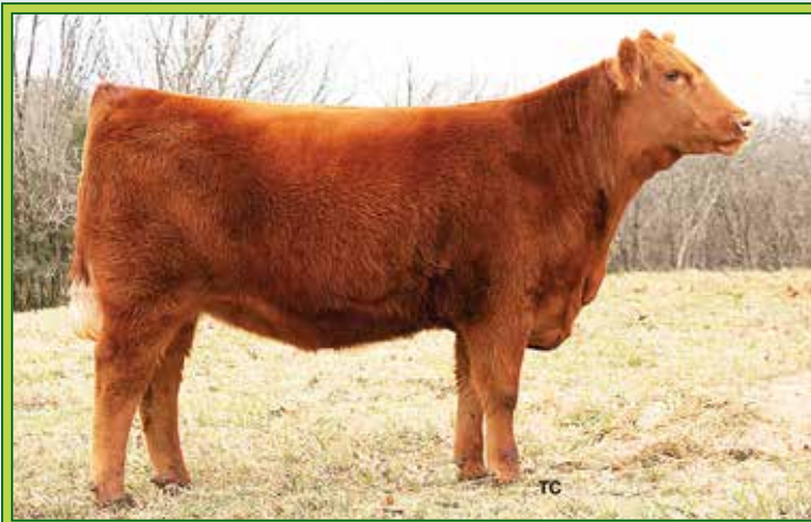
LOT 39 / SL MS 2018 FORTUNATE 2219

This big growthy Fall yearling heifer is the offspring of the most prolific heifer producing female in our herd. We have owned this von Forell bred cow for six years now. She came to Tennessee with a heifer calf at side and has produced a quality female heifer calf for 7 years in a row. We have incorporated numerous of her females back into our herd. We cannot keep them all! You will appreciate this heifer's length of body and length and trimness in the front end. We love her spring of rib, and her structural soundness and agility on the move. She is big boned and big footed. This heifer is in the top 23% in Pro S, the top 11% in Herd Builder, the top 27% in ADG, the top 6% in STAY, top 14% in Yield Grade, and top 16% in Rib Eye Area. She was A.I. bred to Bieber Energize on 12-07-2022 and Pasture Exposed after 12-14-2023 to SL 2003 Mr Coach 2216 and SL 1296 Mr Coach 2007. Video is available.