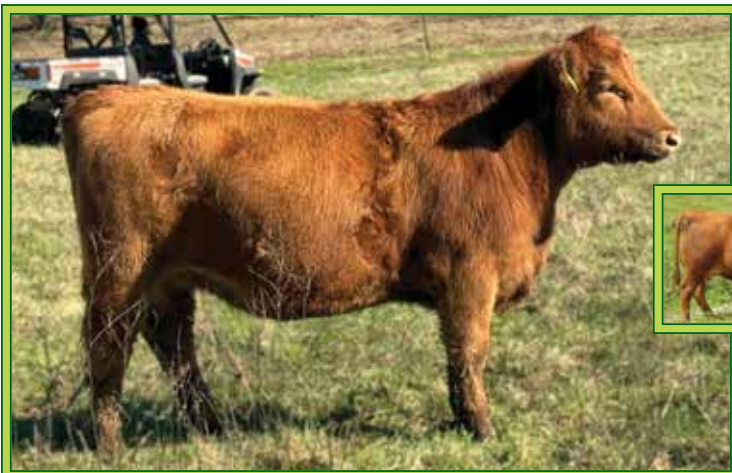
LOT 26 / VETO TIDY BEE 0B12 0K1