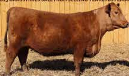
DIX VICILA H0160 160K

2023 GRASSTIMES SALE HIGH SELLING YEARLING FEMALE