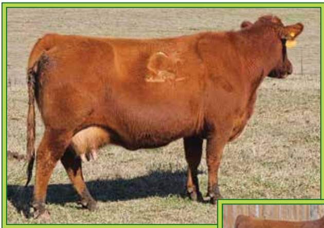
FEDDES JESSA A31-D53

Lot of 3 embryos out of the popular Energize son High Voltage and Feddes Jessa A31-D53. High Voltage semen is tightly held and makes this package very desirable. The accomplishments of the dam in our herd makes the package even more desirable. Jessa D53 was a high seller in the 2017 Big Sky Elite sale. She arrived in Alabama and built a 110 MPPA while advancing her calving date from January to October. She has calved 2 years in a row to AI and weaned our high weaning bull last year – a Stockmarket son that will be used in our herd. Expect great things from this package. Guarantee of 1 pregnancy if embryos are implanted by a certified technician. Embryos may be picked up in Cullman on sale day.