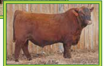
LSF BJR HIGH VOLTAGE 1803J