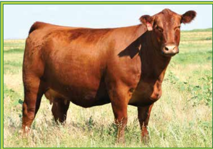
C-BAR STONY 6H