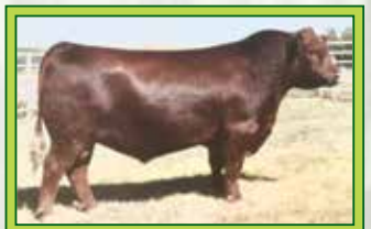
LSF SRR IDENTITY 0295H