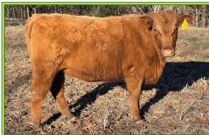
LOT 29 / HEAVEN'S TIDY BEE 2959

Heaven's Tidy Bee 2959 is a bred heifer that goes back to Tidy Bee 589, the most productive cows in our farms history. She produced year after year until we lost her to an injury at the age of 17. 2959 is larger framed female with above average growth and that has been typical of her sire's calves (Bull Hill Domain 9214). She is bred to RVC Crockett 2505, a stout, thick Alamo C92H son out of the grand dam of Larkaba 3055 (pictured above) that we wanted to use for a couple of breeding season. If you want above average growth, great udders, feet, disposition and longevity in your cattle, I recommend taking a close look at these 2 Tidy Bee heifers. Breeding information to be updated on sale day.