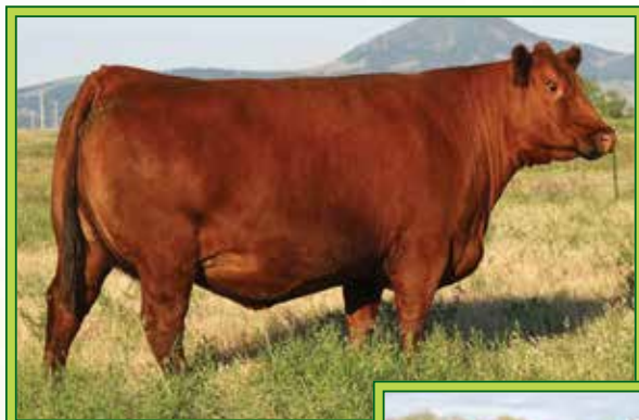
STRA LAURA 718

STRA Laura 718 [3766571] was the 2019 ND Red Select Sale top selling bred heifer. 718 is considered the top daughter of Bieber Laura 158W who is also dam of Hard Drive, Gladiator, Deep End, etc. A 718 daughter [BJR Laura 105J] scanned a 9.58 marbling and is one of the tops of the breed at 1.35 marbling EPD. 718 has hit homeruns on matings such as Stockmarket, Captain, Energize, Complete, etc. Bieber Checkmate K126 [4620529] is a moderate framed with added muscle shape, depth of rib and excellent feet at Select Sires. He has an impressive phenotype with outstanding data across the board as a multi-balance trait leader. Selling 3 Conventional embryos @ Genex Billings with guarantee of 1 90-Day Pregnancy.