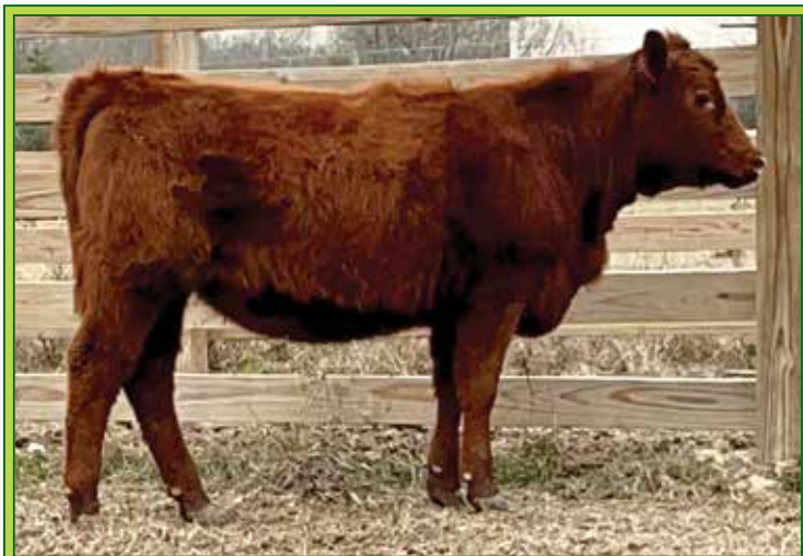
LOT 76 / WRA BONNE L80

Open heifer: Bull Hill Juana 2364, Reg. # 4837190. An impressive daughter of our 116 MPPA donor dam, sired by the great Feddes Brunswick D202. This great cow prospect ranks in the top 25% of the breed for 12 traits and indexes, combining growth, maternal and carcass strength. Her dam is a third generation donor cow who is filling our pasture with great females. Go to bullhillredangusranch.com to view sale video.