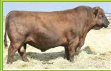
LSF SRR COMMANDER 5906C