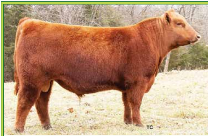
LOT 86 / SL 2003 MR COACH 2214

We are talking maternal and power production with this bull. With his pedigree stacked and backed by some of the best names, 5L, Andras, Pelton, Beckton, his ability and potential should not be questioned. Then a look at his individual performance, 72BW, 100BWR, 711AWW, 128WWWR, will back up his capability. His epds speak of low birth (-2.2BW), top growth (73WW, 107YW) and high maternal (top 25% Milk, top 4% HPG). Use this bull to produce high quality replacement females and/or to produce high gaining steers or bulls. DNA has been submitted to Red Angus to be on file for calf registrations.