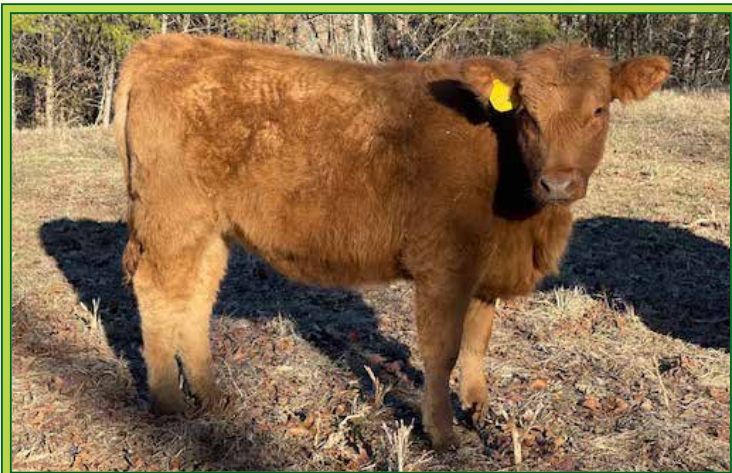
LOT 27 / HEAVEN'S SASSY 2601