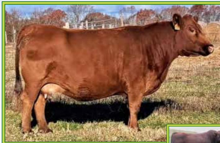
BULL HILL SUSIE 9065 (REG#1364784), EMBRYO DAM

Pregnant Registered Recipient: (Recipient Reg. # 4285751), ET Mating: MLK Creek Fusion 5202, Reg. # 3468393, x Bull Hill Susie 9065, Reg. # 1364784. This mating features one of the most proven calving ease, maternal and carcass sires in the breed and our own Susie 9065, who has posted a 108 MPPA and 364 day calving interval on 12 calves before entering the donor pen last year. Calf is due on 9/30/24, and will be a tremendous asset to any herd. Visit bullhillredangusranch.com for more details.