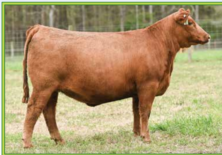
IWC MS DAISY K100, HALF SISTER THAT SOLD IN THE 2023 GRASSTIME SALE

Here is a half sister to the high selling open female in the 2023 Grasstime sale. This Sakic cow, dam of both lots, has been really successful for us. Going back to PIE Cinch on the top side to IWC Ms Sky L101, this super attractive, very feminine heifer will add cow power to your herd. Her Stayability EPD is in the top 1% of the breed! She will have a lasting impact as her retained females will be in production forever. With Ms Sky, the sky's the limit!