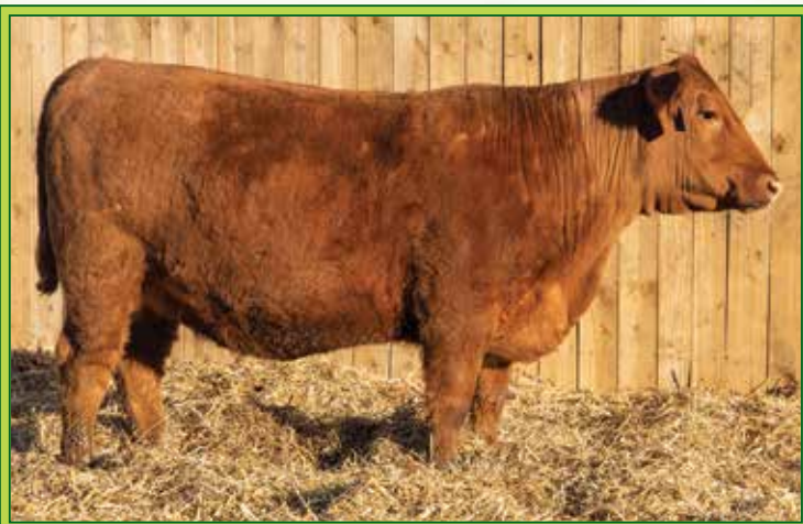
LOT 49 / DIX BERTHA 408G 908K

Consigned by DIXON RED ANGUS / Jed Dixon Athens, AL • jdixon@dixonstables.com • 256/614-4212