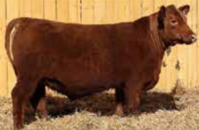
DIX MISSY 9059 259K

"WE STRIVE TO BREED FOR EASY FLESHING ANIMALS THAT WILL BE PROFITABLE ADDITIONS TO ANY HERD"