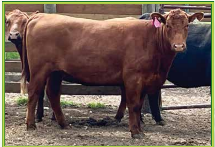
LOT 52 / PVC 043F-103G OMEGA 074K

A.I. on 12/05/23 to Bieber CL Energize F121 (#3958815) with sexed heifer semen.