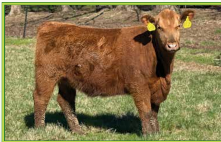
LOT 24 / VETO MINOLA 903H 903K

A fall bred daughter of the rare $115,000 President 8177F. She was raised by a first calf heifer to a 111 WWR giving her dam a 104 MPPA! Her MGD is the now deceased, VVF donor who raised the breed legend LSF Saga as her first calf. 903 is attractive, long bodied and thick made with 11 traits in the top 35% or better, she looks the part too. A true donor prospect that checks all the boxes! AI'd 11/24/23 to the $90,000 outcross Berwald Confident 2044 (4687927) at ABS. Ultrasound confirmed safe to AI on 2/19/24 carrying a heifer. Retaining (1) flush/aspiration of at least 6 embryos at buyer's convenience and seller's expense.