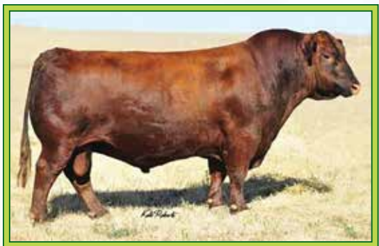
ANDRAS FUSION R236