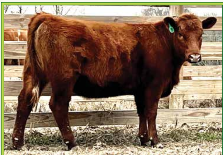
LOT 77 / WRA GINNY L78

Another moderate frame heifer that is starting to come on strong, very good on her feet and has a great disposition. She is out of T5 Bandera bull that has made a many of females that is still in our herd.