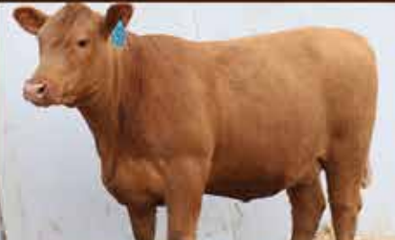
DIX BELGA1419 306F

A HIGH QUALITY COW OUT OF THE FAMED 5L BOURNE 117-48A. SHE'S THE DAM OF 116L IN THIS SALE