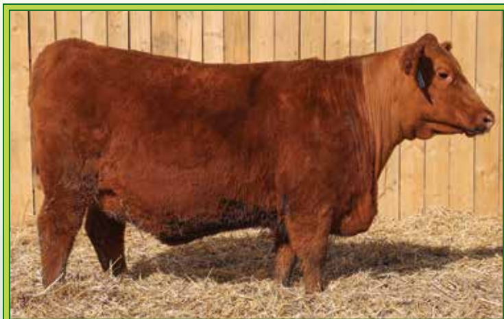
LOT 70 / DIX PINETA E7069 169L