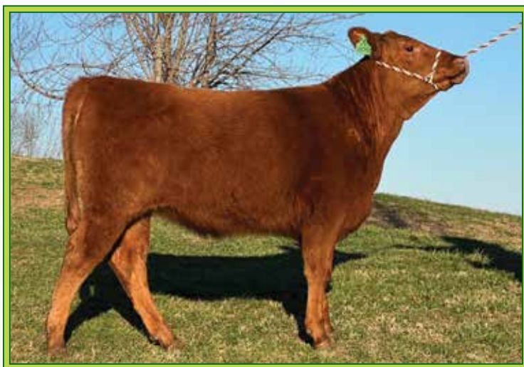
LOT 79 / 5RF 1804L

A fancy September heifer with balanced EPD's all the way across. She is out of the popular John Wick son Private Stock and a Profitbuilder daughter from a past Dixie National Champion Miss Cora 6601D.