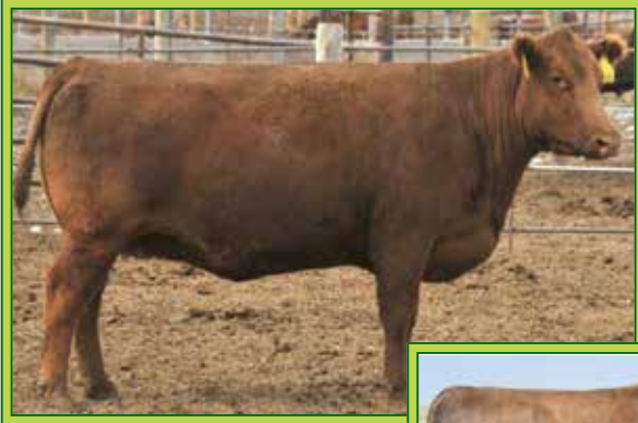
LSF SRR FLO-MARIE 961 D6400