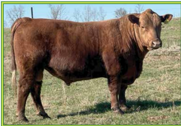
LOT 81 / VETO KENWORTH

Built like a truck, Kenworth is an 18 mo old stud that can move any program forward! He has 8 traits in the single digit percentiles and 11 in the top 1/3. He's moderate, thick, big topped and good footed. With 6 generations of proven AI sires from a dam that's a ¾ sister to the '22 Grasstime high seller, VETO Tilly 930H and a maternal sister to the $20,500 VETO Tilly 306J, her MGD has earned a 105 MPPA and is still sound as a 16 yr old. With President semen being rare and Hard Drive practically nonexistent, he's a perfect opportunity to add proven genetics in a moderate, thick and sound package.