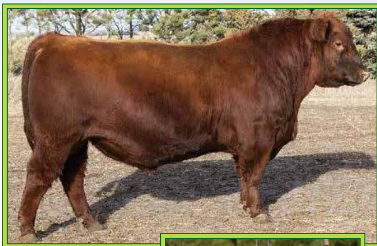
LORENZEN INSIGHT 9917, SIRE

JBSF Vision X02 K17 has a pedigree that is loaded with proven genetics from bulls like Red Crowfoot Ole's Oscar, Brown Vacation H7106, HXC Charter 6610D, and Spur Franchise of Garton. He is also backed by the Tilly cow family. His dam, Tilly X02, produced a daughter that was the high selling lot in the '22 Grasstime auction for Veto Valley Farms (TN) and another daughter that topped the bred heifers in the '23 Grasstime Auction for Veto Valley Farms. X02 has also produced many sons that have sold around the country. K17 is long bodied and full of middle. He has Top 1-10% EPDs for ProS, HB, Stay, and Marb; and Top 11-33% for GM, WW, YW, ADG, and Milk. He has the recipe for greatness: proven genetics, impressive EPD profile, and a great phenotype.