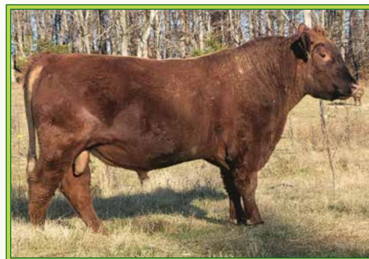
SIRE / WCS REVOLUTION 107

This classy June Heifer has big time potential. She is great on the ground, loads of middle, and still has that great look from the side. She is easy going, halter broke and would add to show string or herd program.