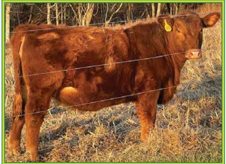
LOT 56 / RVC LARKABA 3055

A moderate framed, long bodied fancy open heifer sired by LASO Alamo C92H. A first calf heifer from and outstanding who is structurally sound with great udder and feet. Her grand dam is one of our top cows in the history of our herd. Her EPDs are rank her high in the breed and she can back them up.