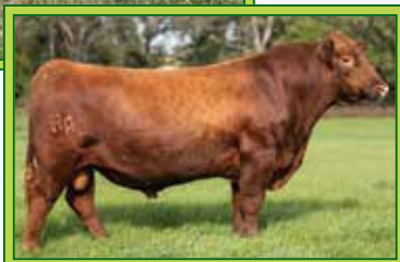
BIEBER JUMPSTART J137