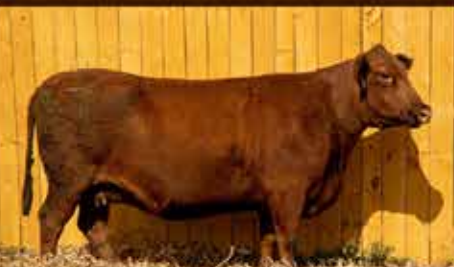
LSF 6RR FLORA Z2018 E7316

A TOP TIER DONOR WITH ADDED POWER AND GROWTH, ACCOMPANIED BY AN IMPRESSIVE 103 MPPA. SHE IS THE DAM OF BOTH 169L AND 112L IN THIS SALE