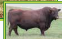
MLK CREEK FUSION 5202, EMBRYO SIRE