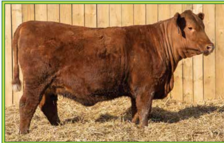
LOT 71 / DIX MS BELGA 306F 106L

Here's another great female off the very top end of our yearling heifers and out of our very best cow family, the "Belga's"! Belga 106L is an ET daughter of the $115,000 LSF SRR President 8177F that semen is very limited on and hard to find. This numbered up, fancy as they come female is out of an Andras New Direction R240 daughter that we raised, and she turned into a great cow we flushed. Her maternal granddam is one of the most powerful, fertile, easy keeping females we've ever owned and at 10 years of age carries a 107 MPPA with one of the very best heifer calves in our fall program on her side. This heifer is moderately made, feminine, dark red, and near phenotypically flawless! Take a look at the set of numbers she boasts with 13 epds in the top 1/3 of the breed with her ProS and HB in the top 9%! To top it off, she had a maternal sister sell last fall in the Andras Kind Female sale that was the second high selling bred heifer!