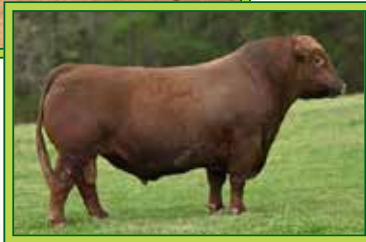
4MC KING OF THE COWBOYS 706