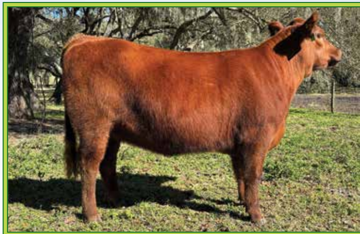
LOT 42 / WATK ALLI 2248

Endless potential in this Sideways daughter! Her sire is proven to produce excellent daughters with a consistent style and look. WATK Alli 2248 is a long-bodied, deep-ribbed, clean-fronted heifer with all the makings of a great cow who could be a cornerstone female for any herd! She sells bred to WATK Hamley 2247 and is due to calve Fall 2024