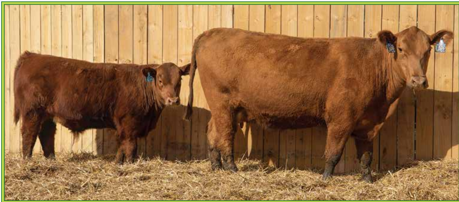
LOT 10 / DIX BLOXY 1094 994J