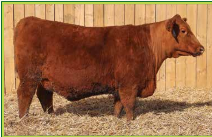
ET FULL SISTER / 169L ET FULL SISTER TO LOT 90

Here's a nice moderately made herd bull prospect out of Bieber CL Energize F121 and one of our main donor females LSF SRR Pineta B4295 E7069. This young sire has really nice depth of body with good feet and legs and also has an outstanding disposition and is as gentle as they come. If you're looking for a bull to use on just heifers or both cows and heifers, I think he'd sure do a great job! With his -3.8 BW EPD in the top 17% of the breed he's definitely heifer safe but also has a good punch of growth with his WW and YW in the top 11% of the breed. His lovely ET full sister DIX Pineta E7069 169L sells in this sale and she's an extremely nice female. I look for the females out of him to make some great replacements!