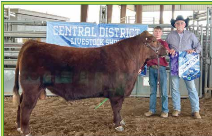
LOT 87 / THREE ACES FERDINAND

Sintek Livestock is pleased to offer this attractive and powerfully made Senior yearling bull, out of a moderate framed Lacy's Red Angus 1st calf heifer.. He is sired by a Sintek bred CRUMP Mr Coach son that was born and raised by Sintek Livestock. We have been absolutely thrilled with the MR Coach 2003 offspring, which bring greater volume and dimension to the calves he's sired. This herd bull prospect is big hipped, wide topped, long sided, deep bodied, easy striding, and clean fronted. He is in the top 11% in HB and the top 9% in STAY. All those characteristics combine into a young herd sire with an awesome disposition. Video is available.