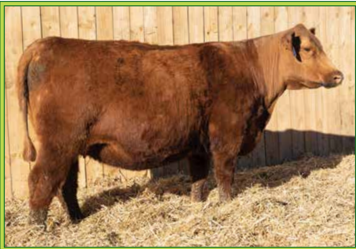
LOT 20 / DIX OSCE 1505 205K

This is the final Osborn Black Genes daughter to sell. Her paternal sisters sell as Lot 16 and 17 and quite possibly may be offered choice on sale day (check the sale order on DVAuction on sale morning). If you want to broaden your genetic base, these outcross daughters will be a great way to do it. P.E. 12/14/23 -3/15/24 to Shady's Red Blood K148 (#4719933)