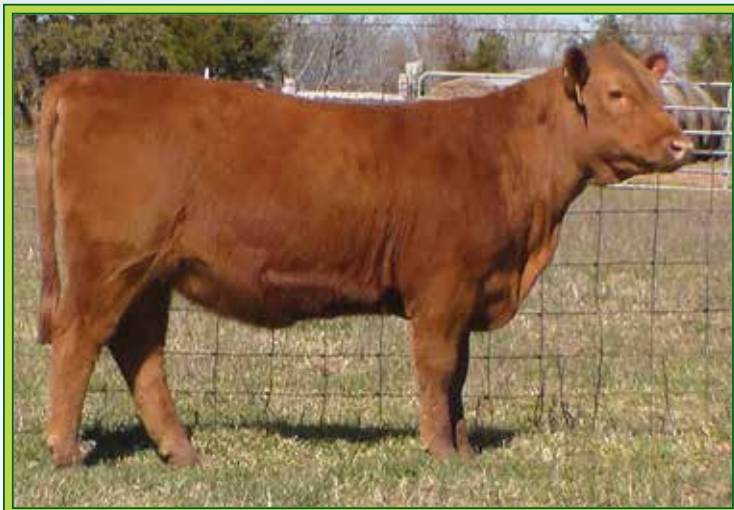
LOT 75 / BULL HILL JUANA 2364