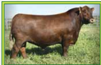
LSF SRR PRIME PLUS 0111H