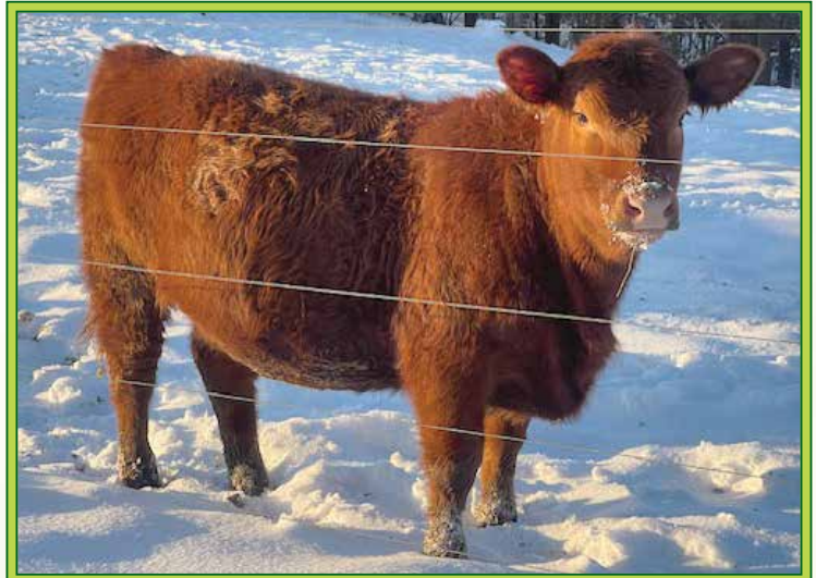
LOT 57 / RVC RITZY 3923

RVC Ritzy 3923 is a powerfully made open heifer sired by LASO Alamo C92H out of a dam that is a tank, with great feet and udder and a perfect disposition. I believe 3923 will be a female that will earn her spot in the top of any herd. If we had not decided to disperse over the next 3 years, these girls wouldn't be leaving the farm.