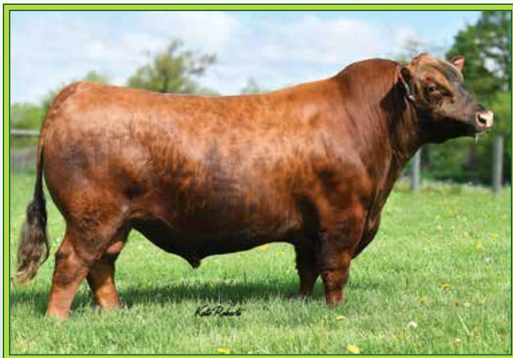
SIRE / 9 MILE FRANCHISE 6305

A great all around female sired by the renowned 9 Mile Franchise 6305, we really didnt want to part with this heifer, but here she is! Her mother sports a MPPA of 105, and being sired by Franchise, she will make a sleep all night calving ease bull that has impressive carcass traits. Holly is an easy fleshing, big middled, sound female that will definitely add to your herd.