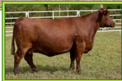
C-BAR TILLY X02, DAM