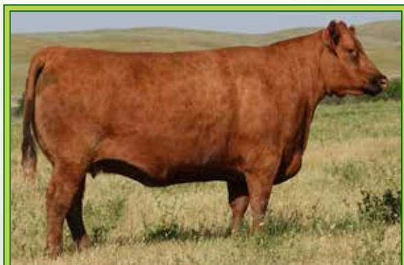
BJR DAKEL 703E