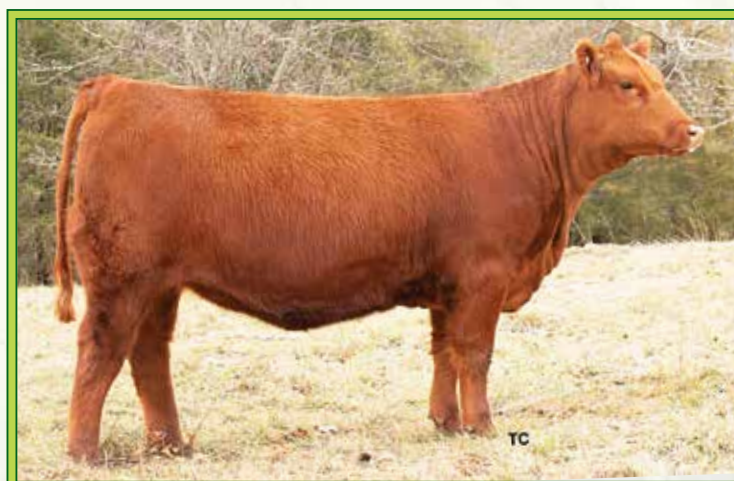
LOT 38 / SL MS 2003 COACH 2215