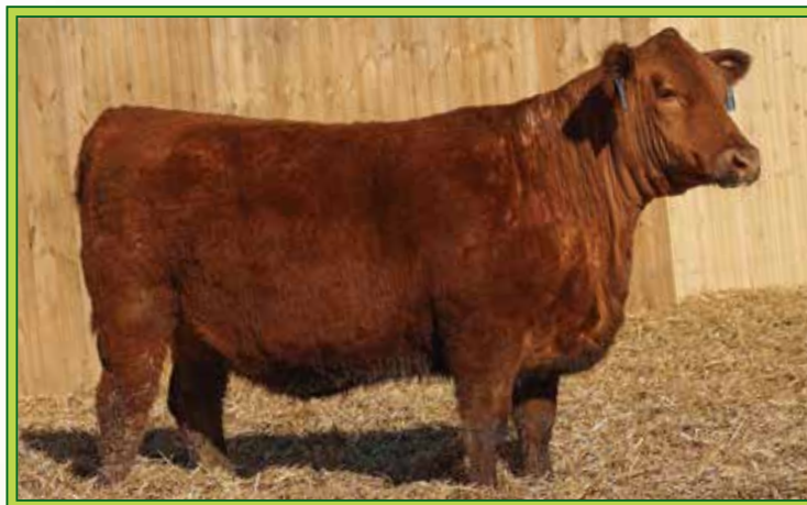
LOT 72 / DIX FLORA E7316 116L

We sure have been pleased with our Bieber CL Energize F121 progeny and this sharp made, deep gutted, wide topped female is why we like him so much! Talk about depth of body and thickness this female sure enough has it and is still very feminine and attractively made. Her dam is a 5L Bourne 117-48A daughter we purchased in the Ludvigson Stock Farms dispersal sale that's done a fantastic job for us, she is an easy keeping, good footed, deep made, good milking cow that has raised some really nice calves for us. Flora 116L boasts a really nice set of EPDs with 12 EPDs in the top 35% of the breed. I look for this heifer to go out and be an outstanding producer just like her dam!