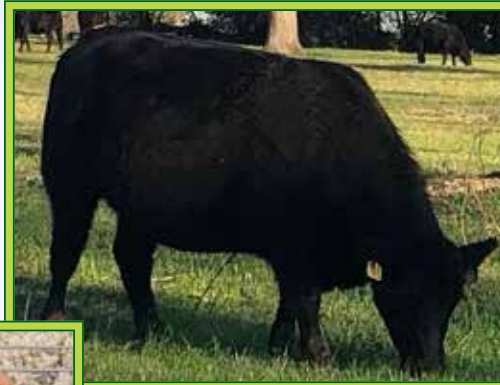
STUMP BELL 202K

Embryos from the Brown Oracle daughter that posts EPDs in the top 5% MARB, 4% REA, 3% ADG, 2% ProS, WW & YW and 1% GM& CW! Mated to the $400,000 PIE Hollywood – just imagine the outcome of this mating! Selling 3 IVF embryos with the 4th embryo given as the guarantee.