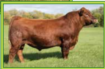
BIEBER CHECKMATE K126