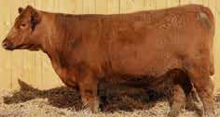
DIX OSCE 237E 937J

A HIGH CALIBER 5L GENUINE 1603-195C DAUGHTER THAT COMMANDED $4750 IN LAST YEAR'S GRASSTIMES SALE. WE'RE PROUD TO HAVE PRODUCED 160K