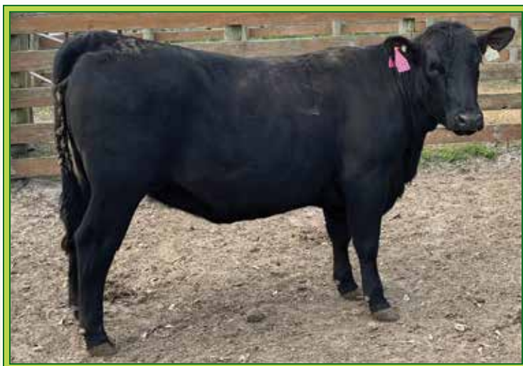
LOT 54 / PVC 042G-D1569 GAMMA 209K

A.I. on 12/05/23 to Bieber CL Energize F121 (#3958815) with sexed heifer semen.