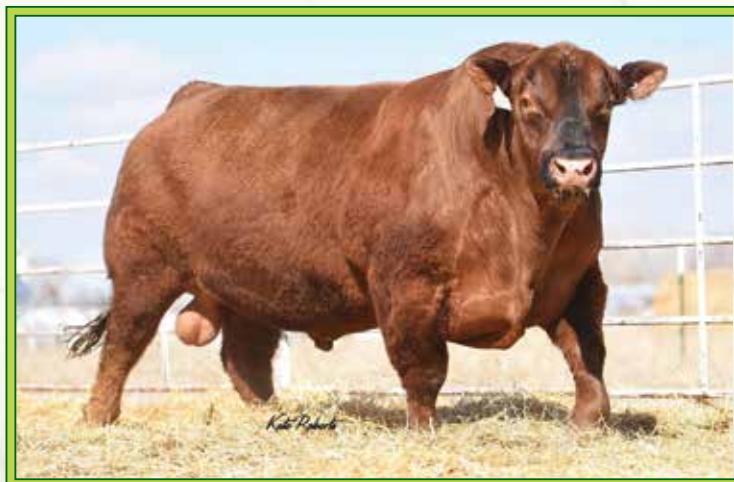
SIRE / 3SCC DOMAIN A163

This Queen Jewel ET heifer stems back to the Foshee/Bootjack donor JRA James 904. 904 was the number one total maternal cow of her era. She was the dam of the $30,000 High Capacity this is found in pedigree's of Wideload and Red Box. This heifer is sired by the very proven sire Domain. 5594 has the looks to live up to the reputation established by her pedigree. A.I'd 12/28/23 to Berwald Confidence.