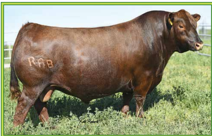
SIRE / BIEBER CL ENERGIZE F121

Lot 67 &amp; 68 – A pair of heifers out of the 9 Mile calving ease sire Enterprise, both heifers are very sound and structurally correct, they are deep sided with lots of spring of rib.