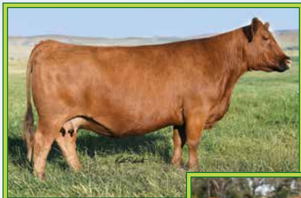
TBJR LARKABA 5100