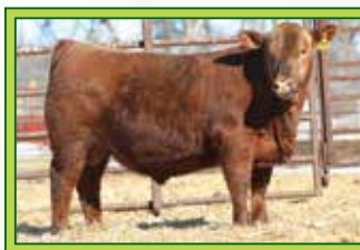
BERWALD CONFIDENT 2044

Opportunity knocks... open the door! This mating combines the great Stony 907G cow with Berwald Confident 2044, the $90,000 high seller at Berwald's this spring to ABS. This pedigree stacks Confidence Plus, Quarterback and Franchise with the Jaylo and Stony cow tribes. Selling five (5) frozen IVF embryos with a guarantee of two (2) pregnancies if implanted by a certified technician.