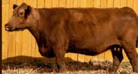
LSF 6RR PINETA B4295 E7069

"WE ARE ALWAYS BREEDING FOR THE HIGH CALIBER CATTLE THAT FIT THE BASICS OF FERTILITY, LONGEVITY, FUNCTIONALITY AND SOUNDNESS."