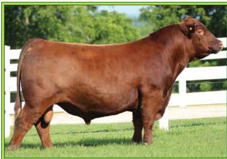
MATERNAL BROTHER / CEDAR RIDGE HELLCAT 052H, MATERNAL BROTHER TO LOT 83

When you see Land Rover on sale day we are certain that you will fall in love. His dam Cedar Ridge Ferrari 833F is without a doubt the best cow we own. She keeps throwing out great ones time and time again. Sired by the popular Red Eagle and a maternal brother to the 2022 NAJRAE Champion Cedar Ridge Hellcat 052H. If you need a true herd sire you better take a close look here.