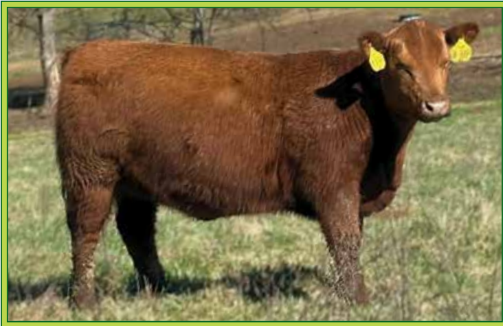
LOT 25 / VETO MISS 903F 916K

916 hails from the prominent "Miss" family at Lazy MC, Canada with her 3rd dam being the great "Miss 67R" whose influence is felt across the US and Canada. She's an attractive, big topped, thick made fall bred that had a 128 IMF ratio, yet still has the maternal look her cow family is known for. With Stockmarket semen becoming more and more rare, 916 is one to latch on to. A/d 11/24/23 to the $90,000 outcross Berwald Confident 2044 (4687927) at ABS. Ultrasound 2/19/24 safe to AI.