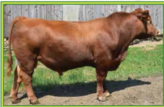
RAISLAND QUARTERBACK 2704