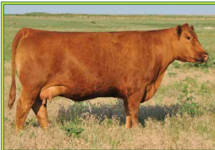
C-BAR STONY 907G