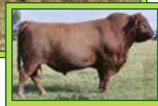
LSF EXC CALL OF DUTY, AI SIRE