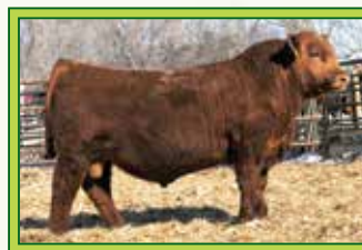
BERWALD COMPLETELY 2056