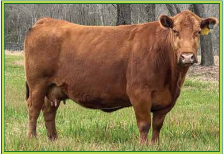
BIEBER TILLY 186C

LSF SRR NextGen 2407K is the $125,000 exclusive bull that is one of the top sires of the $Profit at almost $30,000 for top .1% of breed. Also has $Ranch in top 02%, Fertility in top 0%, Intake in top 8%, and Feed to Gain in top 4% of the database makes this a unique opportunity to be on the forefront of profitable genetics. Selling 4 conventional embryos stored @ Trans-Ova Bryan TX guarantee of 1 90-Day Pregnancy.