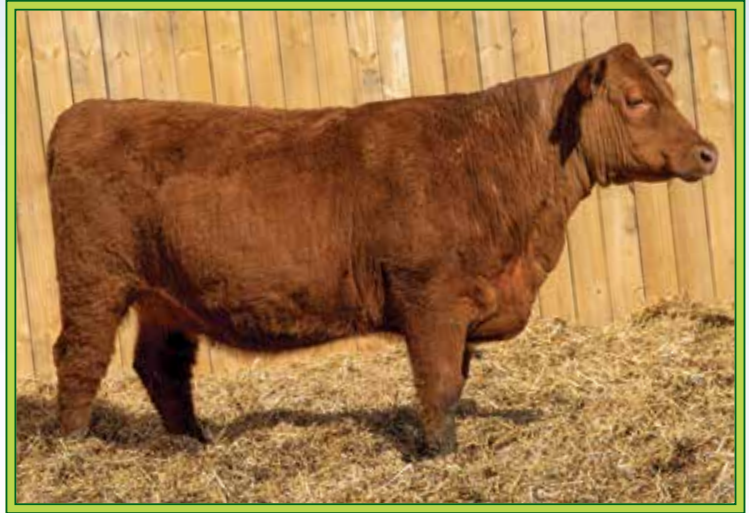
LOT 50 / DIX RUE 301F 901K

Here's a really nice made 5L Foreman 2174-370E daughter that goes back to one of our top cows and past donor Andras Rue B039. This bred heifer is a moderate made female that is dark red, smooth fronted, and has a really nice pedigree. Her sire, 5L Foreman 2174-370E, is one of the top sons out of the great 5L Bourne 117-48A. When I saw Foreman 370E at 5L Ranch, I knew he was a must use sire in our program and we have been very well pleased with the outstanding quality of his progeny! Rue 901K boast a really nice EPD profile with 10 epds in the top 1/3 of the breed! She sells confirmed bred carrying a heifer calf, due on 9-20-24 to our exciting new herd sire Bieber Mainstream K242(#:4621271) a maternal 3/4 brother to the great Bieber CL Energize F121.