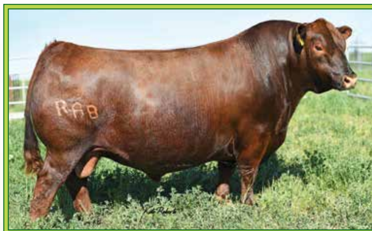
SIRE / BIEBER CL ENERGIZE F121

This super attractive Fall yearling heifer is a stand out in the pasture. She has a beautiful profile, is long bodied, deep middled, stands on lots of bone and is extremely correct on her feet and legs, she's very feminine featured and extended in her front end. She's in the top 21-22% in HB and Calving Ease Maternal, the top 12-14% in Average Daily Gain and Carcass Weight, and the top 7% in Heifer Pregnancy. This heifer is sired by a MR Coach son that was born and raised by Sintek Livestock. We have been absolutely thrilled with the MR Coach 2003 offspring, which bring greater volume and dimension to the calves he's sired. This heifer was A.I. bred to Bieber Stock Market on 12-06-2023 and Pasture Exposed after 12-14-2023 to SL 2003 Mr Coach 2216 and SL 1296 Mr Coach 2007. Video is available.