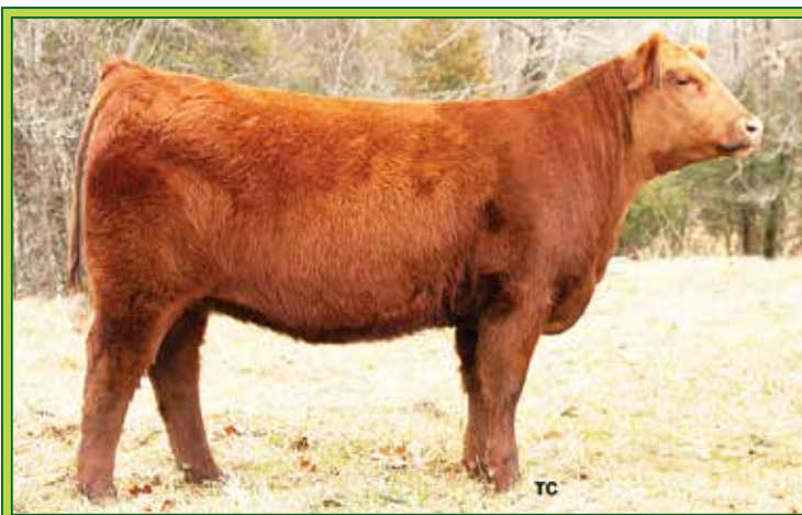
LOT 40 / SL MS 6517 EPIC 2220

This big growthy Fall yearling heifer is the offspring of the most prolific heifer producing female in our herd. We have owned this von Forell bred cow for six years now. She came to Tennessee with a heifer calf at side and has produced a quality female heifer calf for 7 years in a row. We have incorporated numerous of her females back into our herd. We cannot keep them all! You will appreciate this heifer's length of body and length and trimness in the front end. We love her spring of rib, and her structural soundness and agility on the move. She is big boned and big footed. This heifer is in the top 23% in Pro S, the top 11% in Herd Builder, the top 27% in ADG, the top 6% in STAY, top 14% in Yield Grade, and top 16% in Rib Eye Area. She was A.I. bred to Bieber Energize on 12-07-2022 and Pasture Exposed after 12-14-2023 to SL 2003 Mr Coach 2216 and SL 1296 Mr Coach 2007. Video is available.