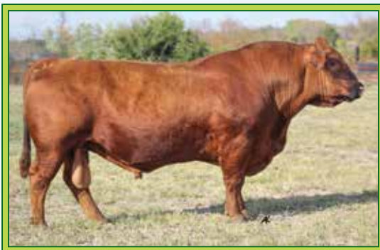
GILCHRIST HIGH ENDURANCE