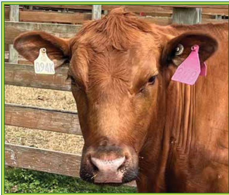
LOT 53 / PVC 042G-212B ALPHA 094K