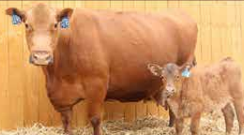
OSBORN BELGA 1419

ONE OF THE MOST INTRIGUING FEMALES WE HAVE PRODUCED, AN ELITE LEVEL DONOR PROSPECT OUT OF THE LEGENDARY RREDS PATHFINDER F811