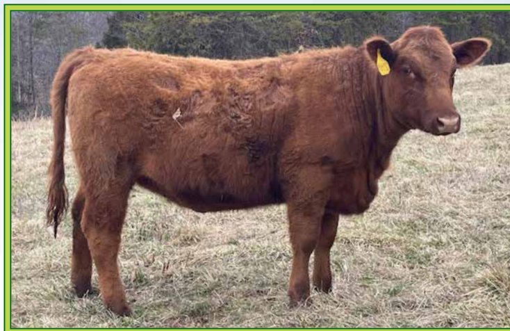
LOT 28 / HEAVENS TIDY BEE 2859

Heaven's Tidy Bee 2859 is a bred heifer sired by Bull Hill 9214 out of a productive dam that is carrying on the legacy of her dam, Tidy Bee 589. 2859 is a larger frame, growth female that has the physical attributes and legacy to be a top performing dam. She is bred to RVC Crockett 2505, a stout, thick Alamo C92H son out of the grand dam of Larkaba 3055 (pictured above) that we wanted to use for a couple of breeding season. Breeding information to be updated on sale day.